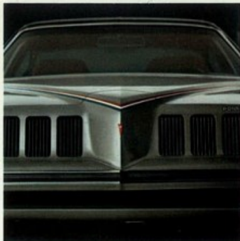
Grand Am front end with pliable nose and new improved bumper system.