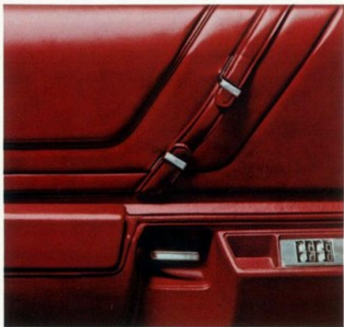
Door panel trimmed in Morrokide with standard assist strap.

We think Grand Am is one of the purest, no-compromise cars to come out of the U.S. That's Pontiac's way with cars.