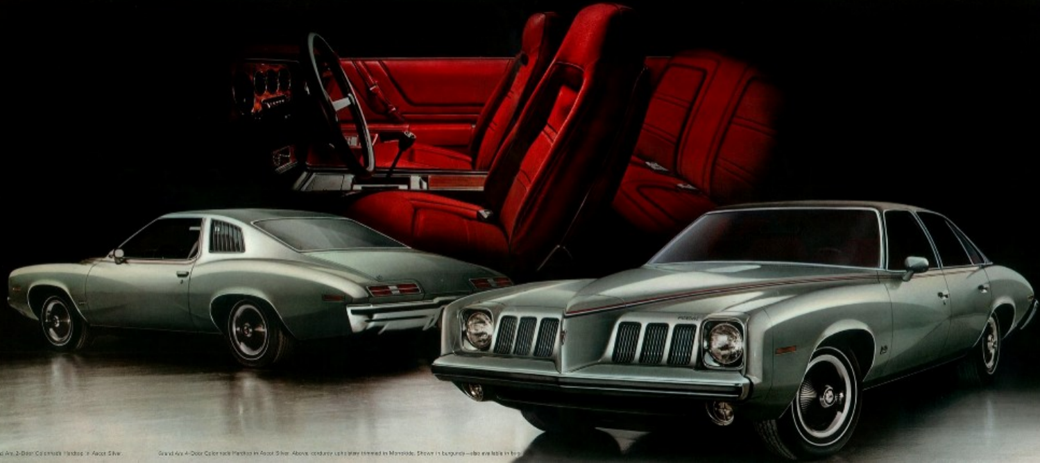
Grand Am, 2-Door Colorado Malibu in Acot Silver.