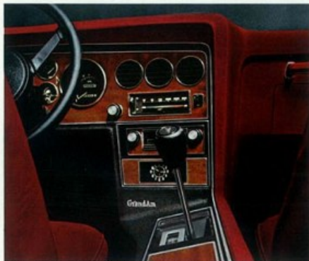
Instrument panel and console inlaid with African crossfire mahogany.