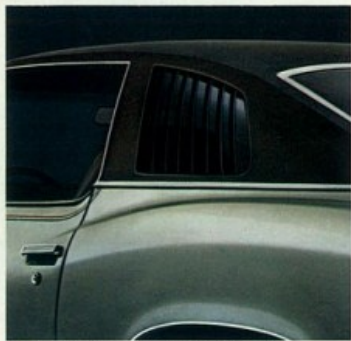
Grand Am louvered rear quarter window.

Wide-wale corduroy or all-vinyl upholstery trimmed in leather-like Morrokide. 3-spoke Custom Sport steering wheel with large padded center. Distinctive instrument panel with genuine African crossfire mahogany inlay. Electric clock. Gauges for oil pressure, water temperature, voltage and fuel. Trip odometer. Plug-in instrument panel components. High-Low ventilation. Console with floor-mounted shift lever and mahogany trim. Ash tray, glove box and courtesy lamps. Inside hood latch release. Headlamp dimmer switch incorporated in the turn signal lever; activated by pulling the lever toward the driver. Reclining front bucket seats with adjustable lower back supports. Nylon-blend, loop-pile carpeting. Pedal trim plates. Pull straps on all doors.