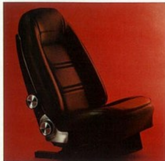
New reclining deep-contoured bucket seat with adjustable lower back support.