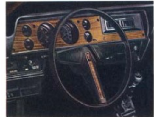
Astre SJ has full rally instrumentation.