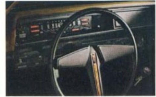
Astre has the look of African crossfire mahogany.

Until now, you couldn't get a Pontiac Astre.