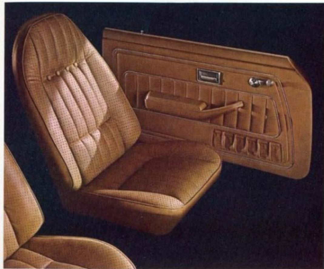
Astre's all-Morrokode upholstery. Shown in saddle—also available in black, burgundy, sandstone and white.

A custom cushion steering wheel, electric clock, tachometer and rally gauges are set off by the look of African crossfire mahogany on the instrument panel.