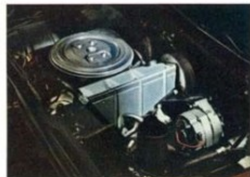
Economy starts here. Astre's overhead cam engine.