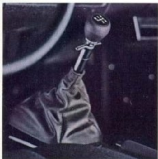
It wouldn't be a Pontiac if you couldn't get a 4-speed.

Special cloth and Morrokide upholstery and interior trim. Rally gauges, including tachometer, water temperature, voltmeter and electric clock. Custom cushion steering wheel.