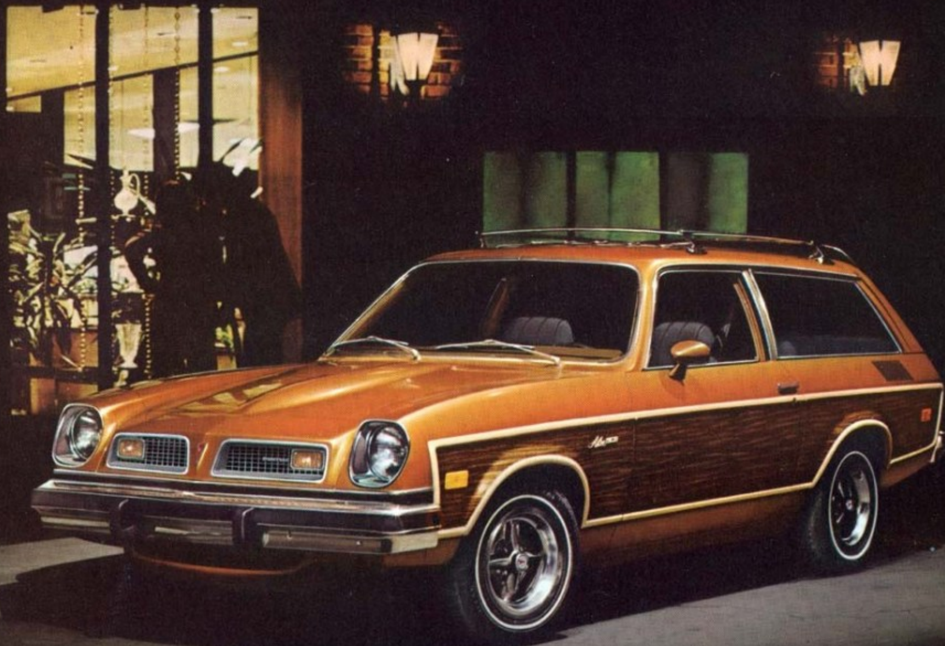
Astre SJ Safari Wagon.