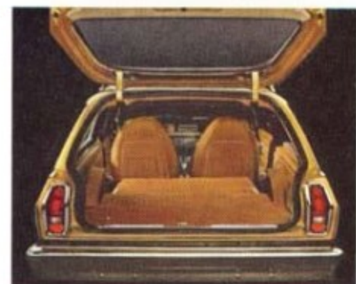
Astre Safari's 46-cu.-ft. cargo area.

In short, a standard interior that looks like extra cost.