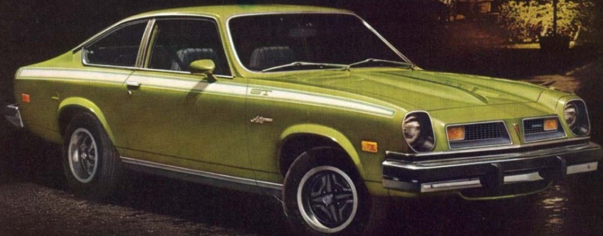
Astre GT Hatchback Coupe.