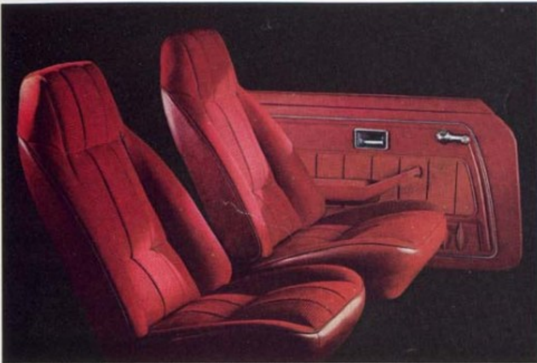
Believe it or not, this is the standard interior of Astre SJ. Cloth and Morrokide buckets shown in burgundy—also available in blue and black.

There are lots of solid reasons for buying a subcompact these days. The way they seem to scamper through heavy traffic. Zap into the tightest parking spots. Hold a lot of gear in a little space. And maybe most important, the way they manage to get all those miles out of a gallon of gas.