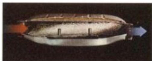
The catalytic converter—part of Pontiac's Maximum Mileage System—helps give you good mileage.

Tilt steering wheel. Power steering. Custom air conditioning. Woodgrain body siding. Formula steering wheel. Limited slip axle. Rally gauges. Electric rear window defroster. Safari rear window wind deflector. Rally and Rally III wheels. Cordova vinyl top. And much more.