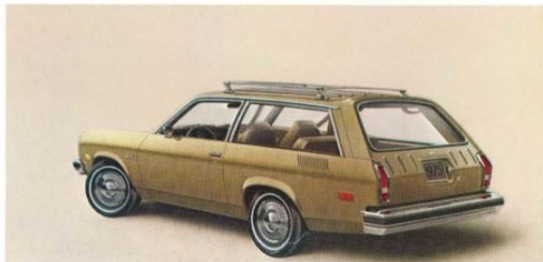
Astre Safari Wagon.

Front and rear stabilizer bars, 2-bbl. carburetion, a quick rear