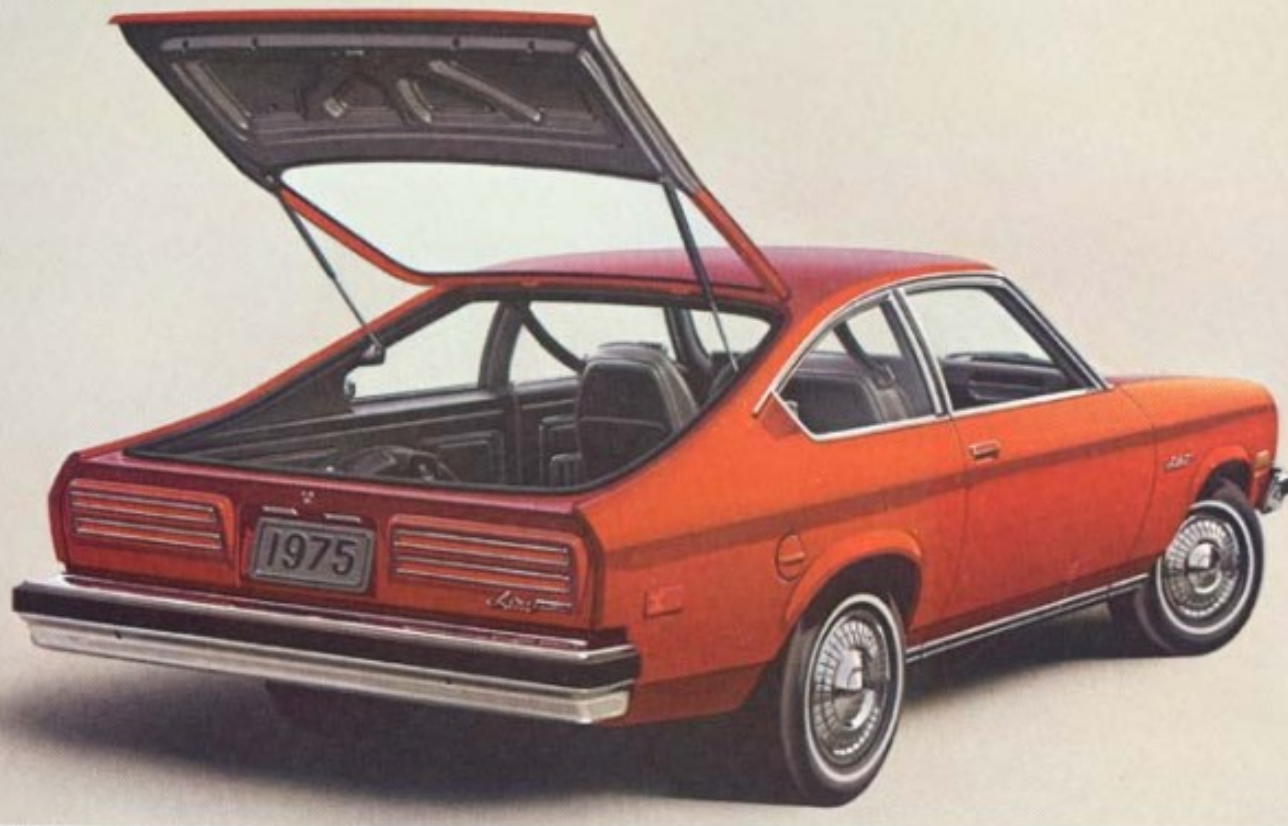
Astre Hatchback Coupe. The hatch pops up, the rear seat folds down to give you lots of easy-to-load cargo space.

Astre SJ. Now, everybody knows a subcompact can't be a luxury car. But our new Astre SJ might be cause for some new thinking.