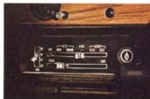
You can even order air on an Astre.

Fuel tank—16.0 gals. Cooling system—7.6 qts. Oil, less filter refill—3.0 qts.