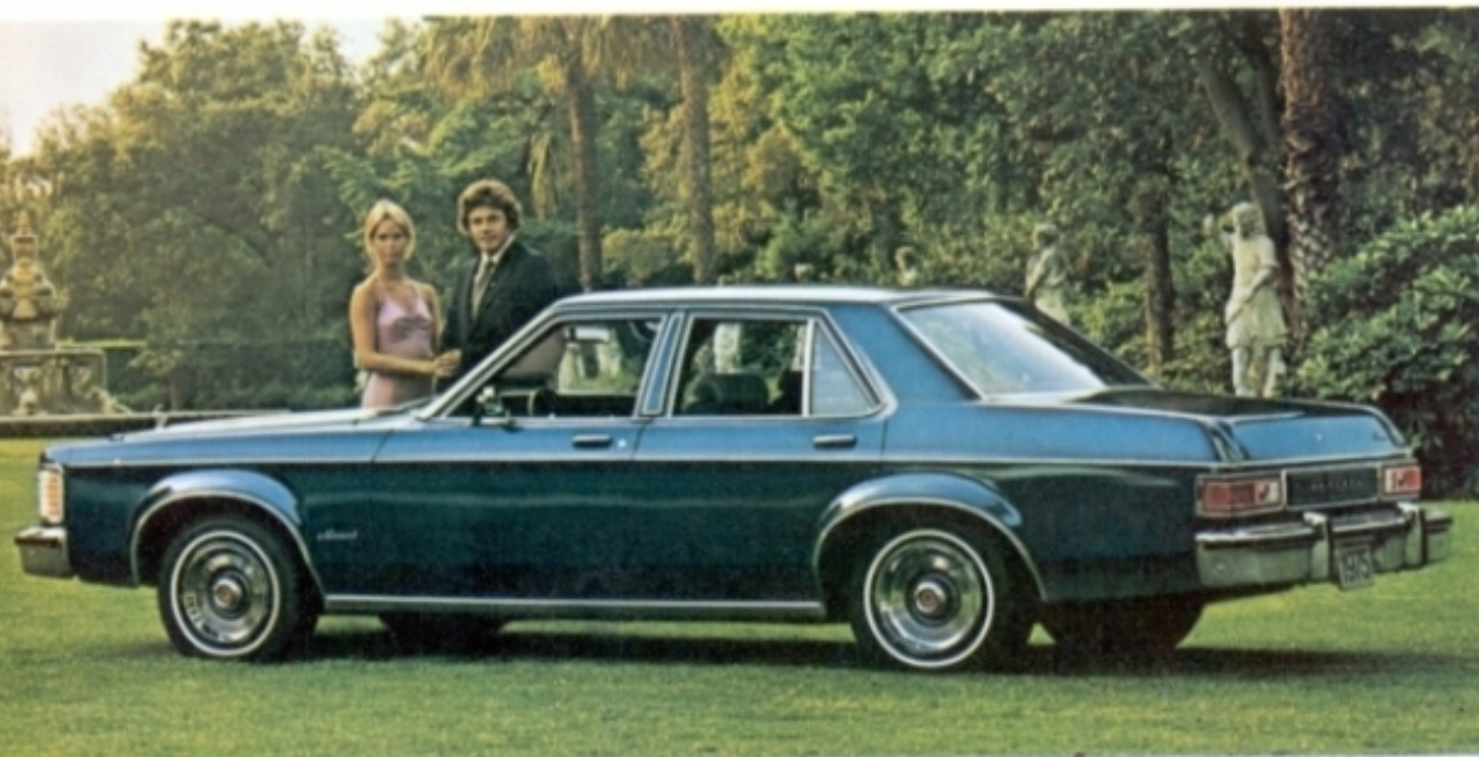
MERCURY MONARCH 4-DOOR SEDAN, shown with optional WSW tires and bumper protection group.

Information shown here was correct when approved for printing. Lincoln-Mercury Division reserves the right to discontinue or change specifications or designs at any time, without incurring obligations.