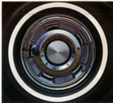
Deluxe Wheel Covers—are an inexpensive bit of added style. Standard for all Cyclone models.