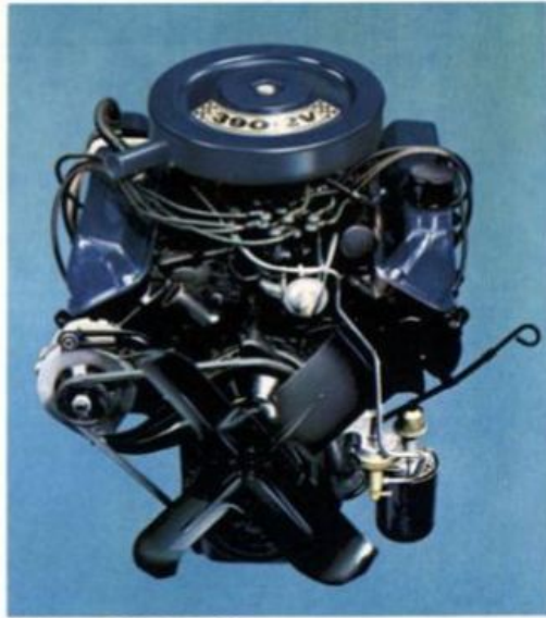
Cyclone 390 V-8 (2V)