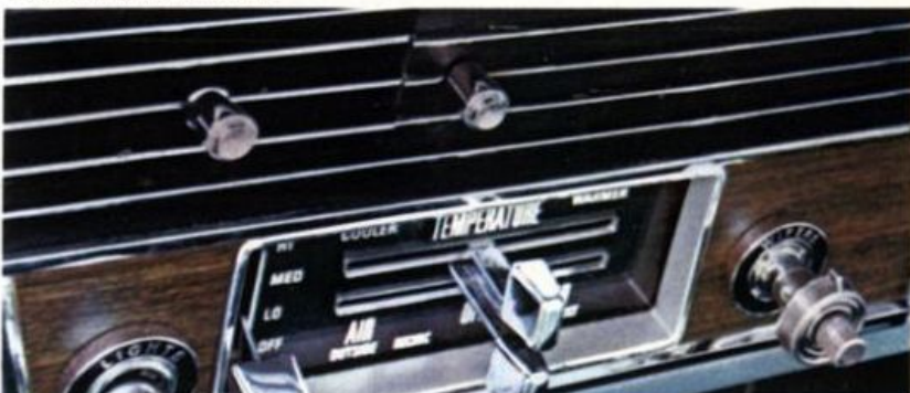
Deluxe Air Conditioner—cools, dehumidifies, filters out dust and pollen. A built-in instrument panel unit.