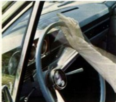
Power Steering—helps take about 88% of the effort out of steering, while still giving you excellent road feel and driving control.