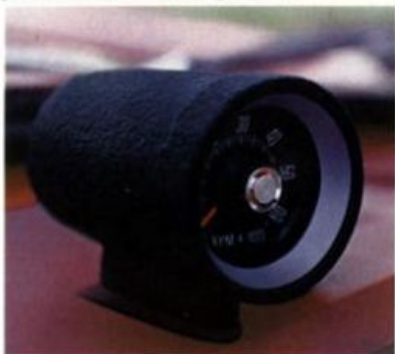
Tachometer—is sure to be wanted by most automotive buffs. Especially recommended for 3- and 4-speed manual transmissions.