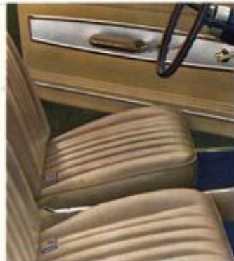
Bucket seats are standard in Cyclone interiors

The dramatic, racy design and unique grille herald potent action. And it's there with a Cyclone 289 V-8, standard. Offered in convertible (left) or 2-door hardtop. A neat, dual pinstripe emphasizes the flow-through sweep from front to rear. Another distinguishing mark—handsome moldings decorating the tucked-under rocker panels and extending full length between the wheelhouses. Deluxe wheel covers add even more flair. Interior appointments enhance Cyclone's sporty look: unique steering wheel, color-keyed vinyl door trim panels with a brushed-finish center area, black camera-case instrument panel and a full front floor console. Newly designed crinkle-vinyl bucket seats (below) are standard for both Cyclone models. Colors: black, red and blue plus 13 two-tone interiors . . . six featuring white bucket seats, seven parchment, each with color-keyed appointments.