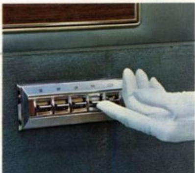
Power Windows—are a new item for '66. Beside the driver is a master control switch; an individual control is at each window.