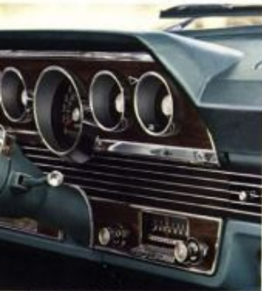
Move dash in the Caliente instrument panel for '66. Simplified wood-grain finish outlines the big-dial speedometer and other conveniently located, easy-to-read instruments.

As luxurious as it is practical. The Caliente sedan is a car for going places in style. With people who appreciate comfort and distinction. The four doors swing wide-open to permit easy comings and goings. Six adults can relax in the spacious interior. A stylish and practical exterior highlight: bright drip moldings in addition to bright door frames.