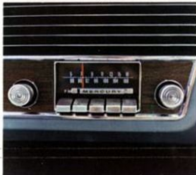
AM/FM Radio—offers instant play of your favorite radio station. Five push buttons can be set to either your AM or FM broadcasting choice.