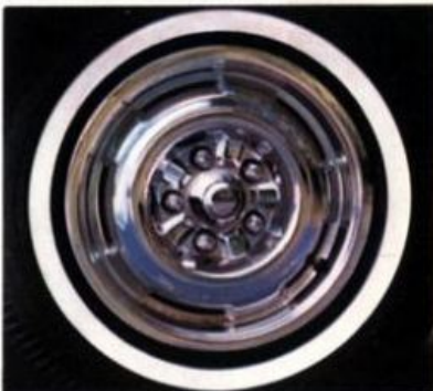
Cyclone Wheel Covers—for that special look of sporty luxury. Available only for Cyclone models.