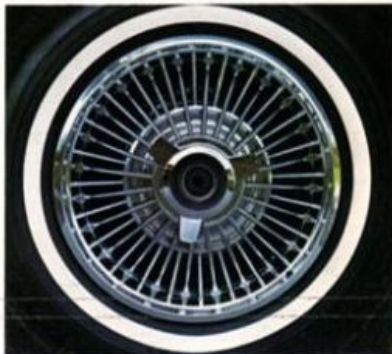
Wire Wheel Covers—have handsome simulated knock-off hubs and are made of gleaming, non-corrosive, spun stainless steel.