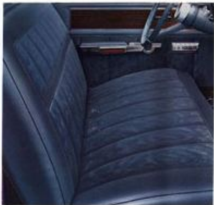
Caliente cloth and vinyl interiors are upholstered in rich pleated Corduroy Fabric and vibrant vinyl. They say elegance in quiet, good taste. Four color combinations available for interior: blue, aqua, ivory gold and parchment; hardtops: blue and parchment.