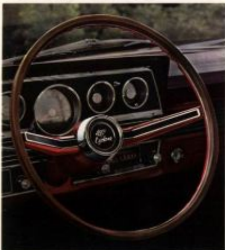
Highlighting the Cyclone GT interior is a black, canvas-case finish instrument panel with easy-to-read gauges plus a sports-style steering wheel.