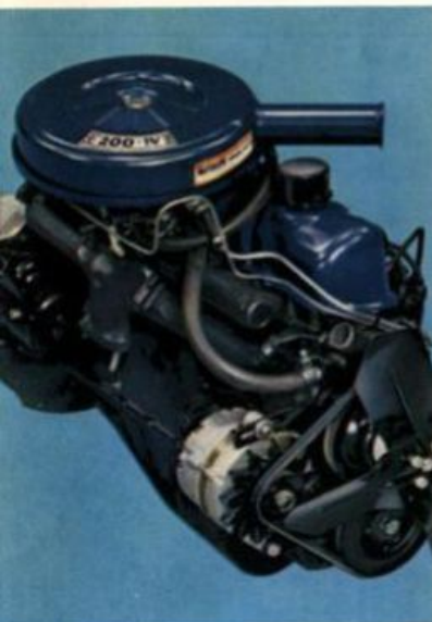
Comet 200 "6"