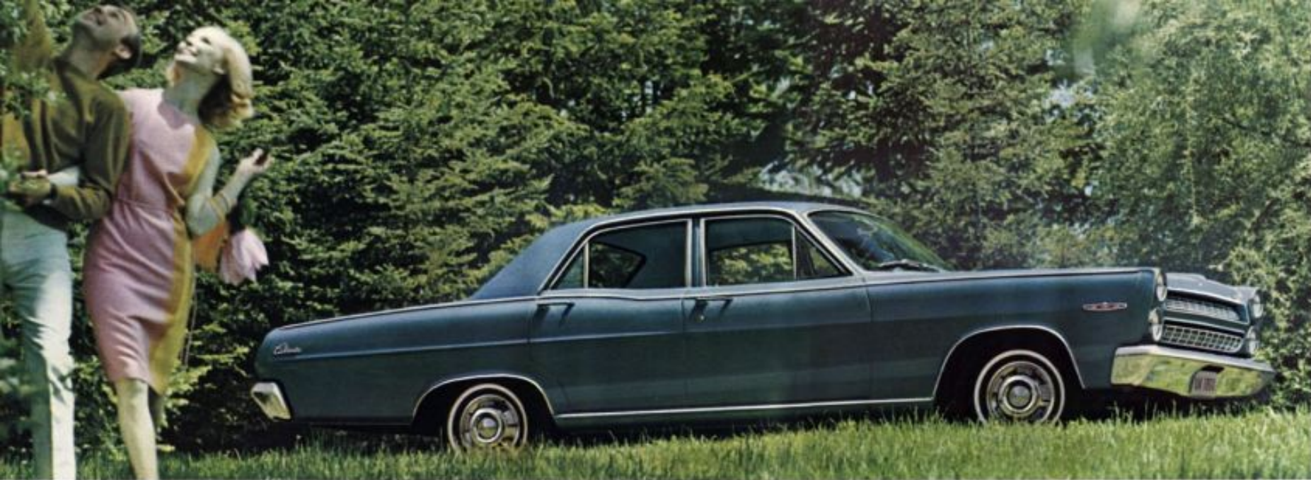
Comet Caliente 4-Door Sedan