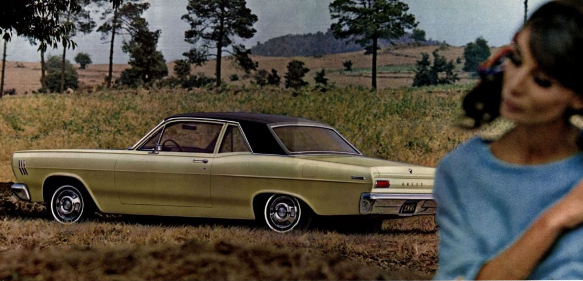
Comet 202 2-Door Sedan with optional Oxford Roof