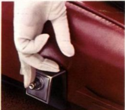
4-Way Power Seats—move fore and aft as well as tilt up and down. Available for both bench and driver's side bucket seats.

X—Recommended O—Also available R—Reversible