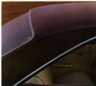
Oxford Roof (vinyl-covered)—lends a distinctive note of elegance to the 2-door sedan, all hardtops and the Caliente and Capri 4-door sedans.