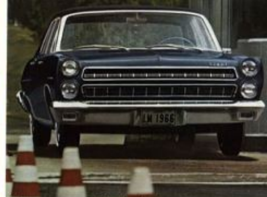
Coming your way . . . new Comet Capri action