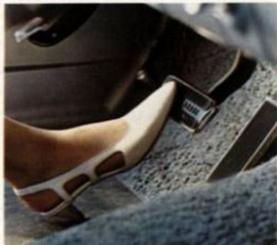
Power Brakes—give you efficient stopping power along with a 40% reduction in foot-pedal effort.