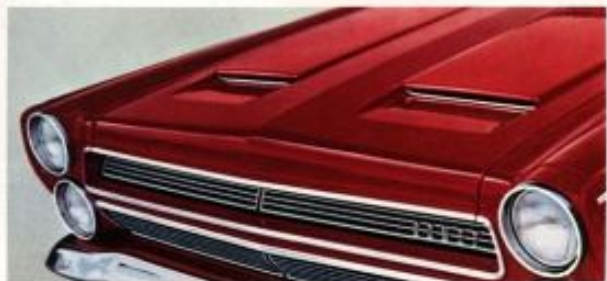
Distinctive Twin Scoop GT Hood is glass fiber and is a standard component for both GT models.