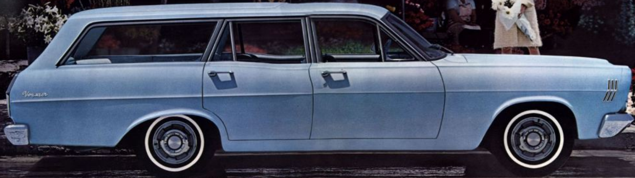
Comet Voyager 4-Door Station Wagon