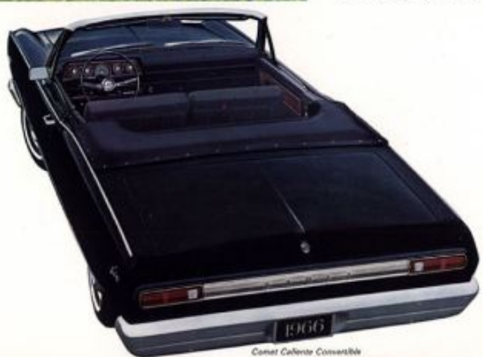
Comet Caliente Convertible

Top-down fans need look no further. The Caliente convertible is all-new for '66. Stylish curved side glass windows. A real tempered-glass back window—won't scratch or mar. A power-operated 5-ply top that's been laminated for maximum strength and durability. And side clamp retention makes it more convenient to raise or lower the top.