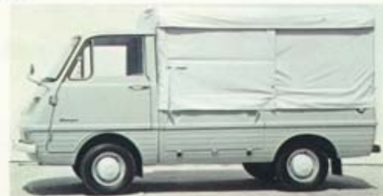
Hooded Model (FSA (U))