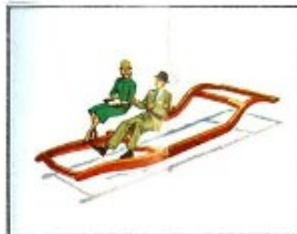
OTHER CAR FRAMES

In Hudson, you ride within the frame—not on top of it. A sturdy barricade of all-steel, all-welded box girders completely surrounds you—protects you ahead, behind, above, below, and on both sides. It's rattle-free; it's trouble-free; it's literally twice as strong and twice as safe!