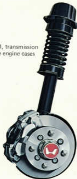
Front disc brakes with safety servo-mechanism