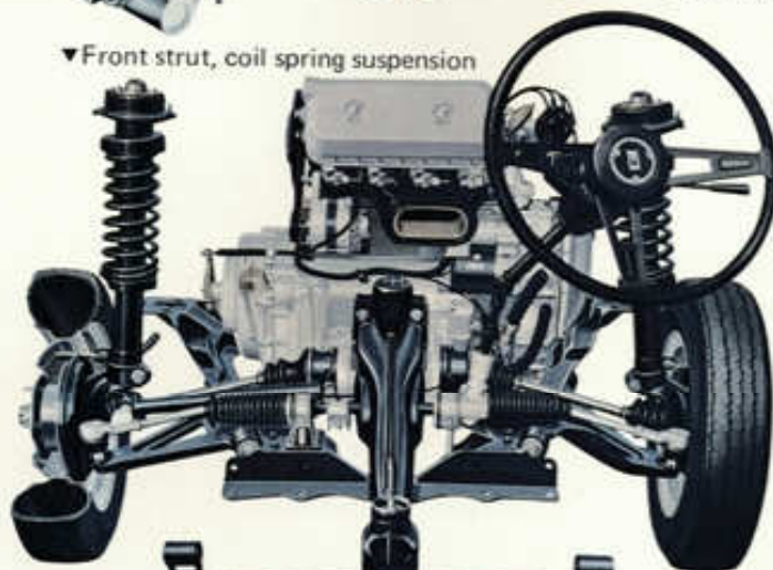
▼ Front strut, coil spring suspension