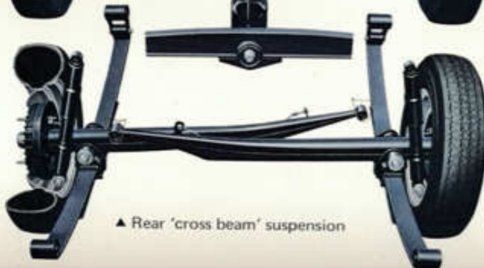
▲ Rear "cross beam" suspension