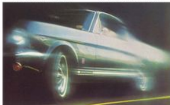
Mustang's Special Handling Package* (heavy-duty suspension, 22 to 1 overall steering ratio)