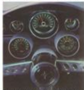
Night-lighted Rally Pac (clock & tach)* *Optional