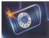
Fade-resistant Front Disc Brakes**