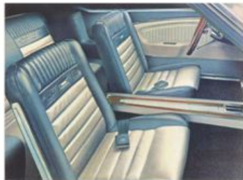
Rich Interior Decor Group* offers unique embossed seat inserts, door panels with pistol-grip door handles, built-in arm rests, safety-courtesy lights and more (below).