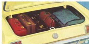
Mustang's trunk is surprisingly spacious and well-planned for easy loading.