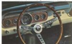
Woodlike Deluxe Steering Wheel†, instrument panel and glove box trim are part of Interior Decor Group*