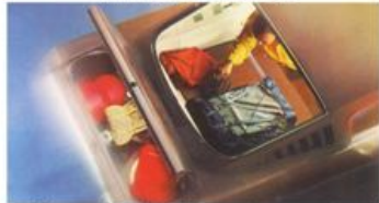
Folding rear seat displays the Fastback's luggage space. Door opens to trunk area