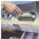
AM Radio/Stereo-sonic Tape System*