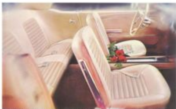
Mustang's deep-foam bucket seats and pleated vinyl trim come in your choice of five colors

Start here to make your kind of 1966 Mustang! Options shown on Mustang Hardtop (left): Vinyl Roof Covering (also avail. in white), Access Stripe (mocker panel moldings are standard on all '66 Mustangs), Deluxe Wheel Covers (with simulated knock-off hubs). Others include: Choice of Three V-8's (up to 271 hp!) • 4-Speed Manual Transmission • Power Steering • Power Brakes • plus options shown here and on following pages.