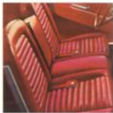
Full-Width Front Seat with folding arm rest!