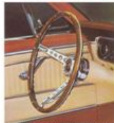
Woodlike Deluxe Steering Wheel*