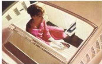
High-style interior in the Mustang Fastback 2+2