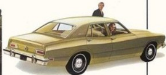
The Basic Maverick 4-Door Sedan in Light Green Gold Metallic (Code 4Z), just one of 14 exterior color choices for 1975. Slight drip rail and wheel lip moldings are standard.

Notes: See Notable Standard Features on back cover. Other items shown are optional. See pages 6-7 for options in detail. Also see Color Code reference and measurements on back cover.