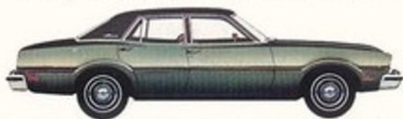
Maverick 4-Door Sedan—Dark Yellow Green Metallic (Code 4V)