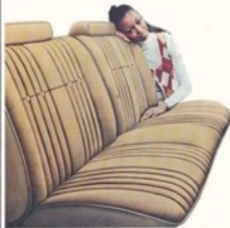
Interior Decor Group option, lets you round out the Exterior Decor package with glamorous touches inside: Choice of pleated deluxe cloth and vinyl trim, shown here in Tan (L.S.), or pleated all-vinyl, also comes with deluxe door trim, deluxe steering wheel, color-keyed deluxe belts—and more (see page 7).

For added luxury and visual appeal, you'll want to consider such options as the Interior and Exterior Decor Groups illustrated here—and many others detailed on pages 6 and 7.