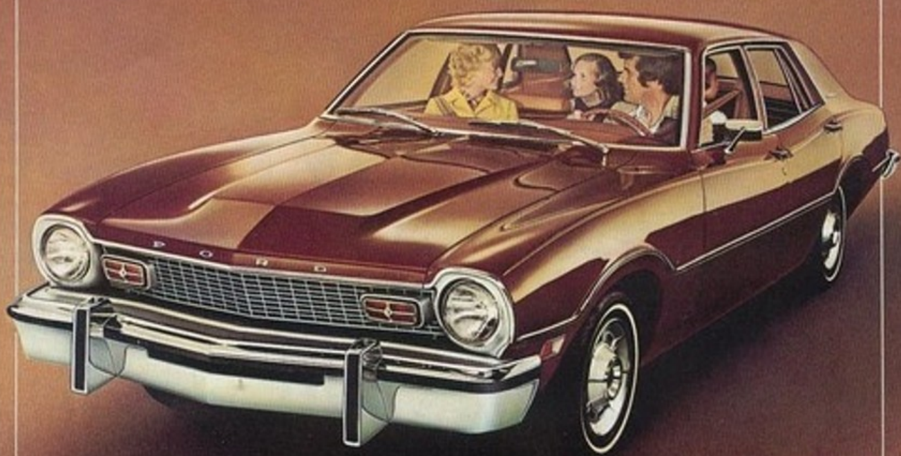
Maverick 4-Door Sedan