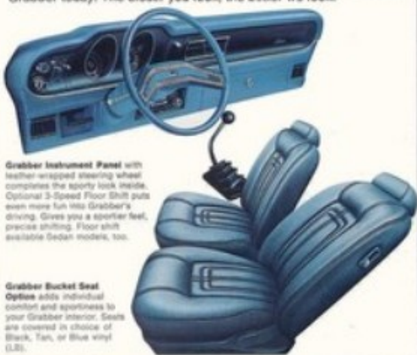
Grabber Instrument Panel with leather-wrapped steering wheel completes the sporty look inside. Optional 3-Speed Floor Shift puts even more fun into Grabber's driving. Gives you a sportier feel, precise shifting. Floor shift available Sedan models, too.