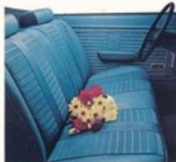
Standard Grabber Interior (and optional on other models) is trimmed in easy-to-clean, all-vinyl in Blue (H), Black, Green or Tan.