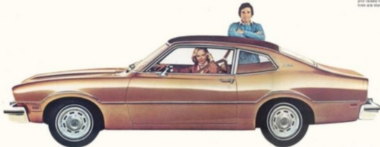
Exterior Decor Group , shown on 2-Door above. Extra glamour at a price that's hard to beat. Includes wheel covers, vinyl insert body-side moldings, body-side accent paint stripes and bright chrome around side windows (see page 7). Tan-Glow (Code 9L).