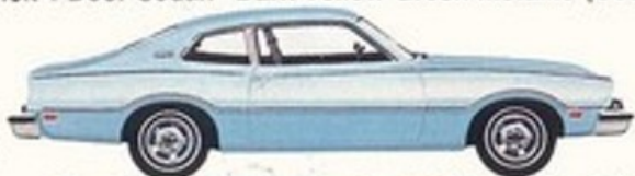
Maverick 2-Door Sedan—Pastel Blue (Code 3Q)