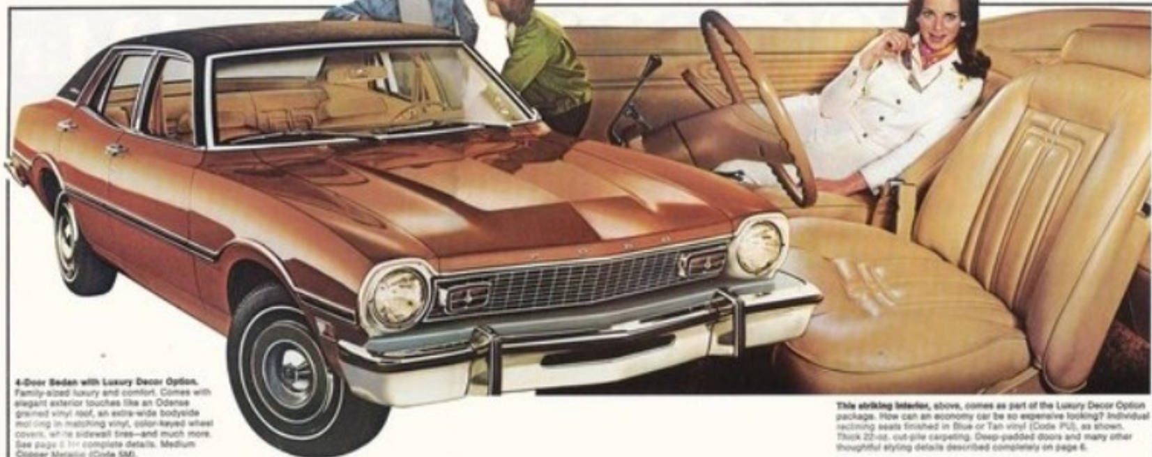
4-Door Sedan with Luxury Decor Option. Family-sized luxury and comfort. Comes with elegant exterior touches like an Odense grained vinyl roof, an extra-wide body-side molding in matching vinyl, color-keyed wheel covers, all-rib sidewall strip—and much more. See page 6 for complete details. Medium Clasper Metallic (Code 5M).

*35 or 40 months as indicated inside glove box.