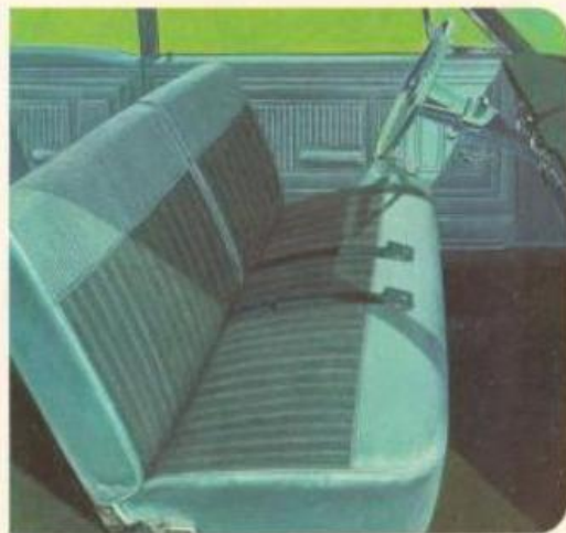
Falcon Club Coupe interior. Your choice of three handsome, durable vinyl-and-cloth interiors just like this. Courtesy lighting, foam-padded seats, foot-operated parking brake, suspended accelerator pedal are a few of the big-car features standard on every Falcon.

industry. Finally, compare Falcon for price. You'll find Falcon economy follows through all the way .