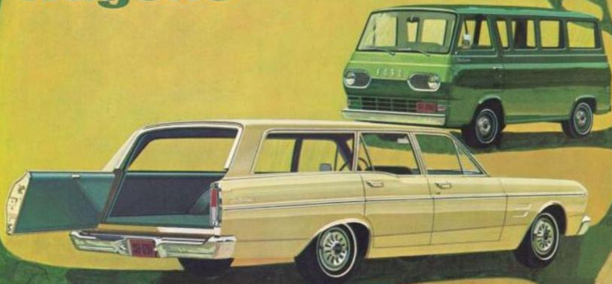
Falcon Futura Wagon