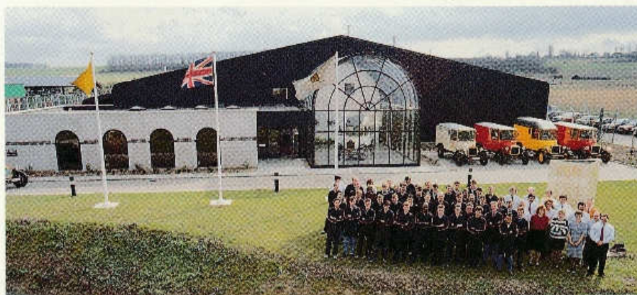
Leaders in our field through team quality.