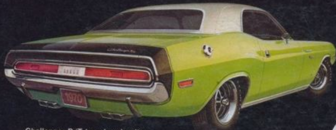
Challenger R/T two-door hardtop