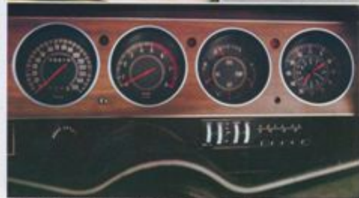
Five-gauge group including top odometer, tach, oil pressure gauge, and clock.