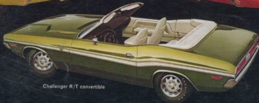
Challenger R/T convertible