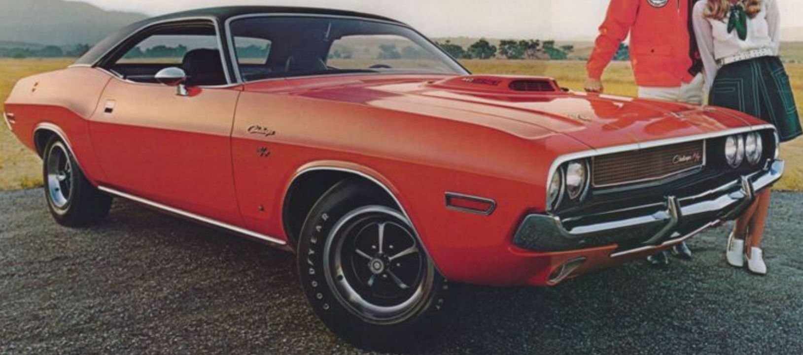
*"Shaker" hood? Yes, functional scoop attached directly to carb. "shaker" at idle.

Challenger R/Ts offer stripes as standard equipment . . . but you don't have to take them. Why not let folks wonder for a while? One more thing. The Hemi is still offered. Optional, at extra cost of course. But when you're talking that kind of "go" . . . what else is there?