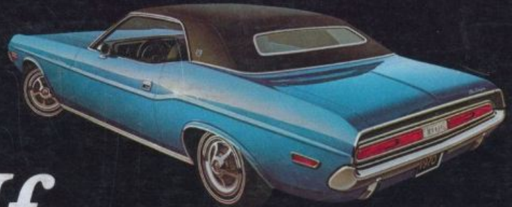
Challenger SE two-door hardtop

If you're the kind of person this car says you are, you could be Dodge Material.