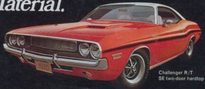
Challenger R/T SE two-door hardtop