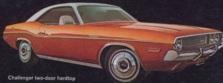
Challenger two-door hardtop