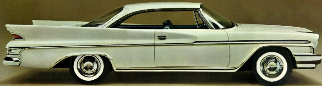
DeSoto 2-Door Hardtop

additional roominess, the distinctive refinements and the reassuring "feel" of an automobile in DeSoto's class. It offers all of these things, in superior measure, at a price you will find surprisingly low. Surely, the 1961 DeSoto has much to offer you. In this brochure, you will find some of the reasons you should look into this new car. Your Plymouth-DeSoto dealer will show you many more.