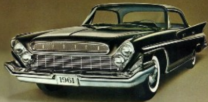
DeSoto 4-Door Hardtop