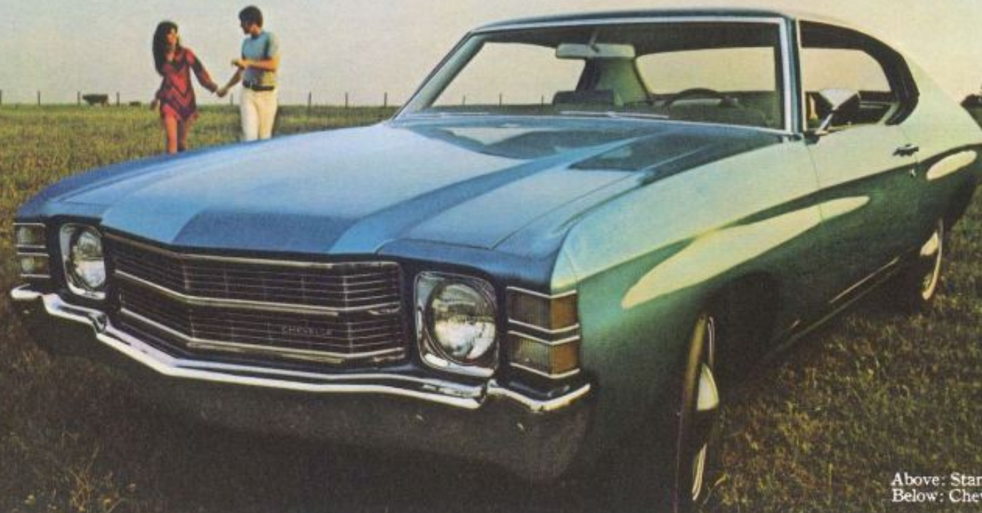
Above: Standard Chevelle cloth-and-vinyl interior. Below: Chevelle Sport Coupe.