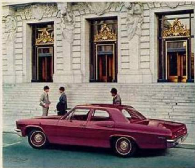
Biscayne 4-Door Sedan in Madeira Maroon.