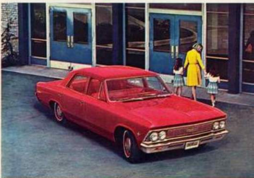
Chevelle 300 4-Door Sedan in Regal Red.