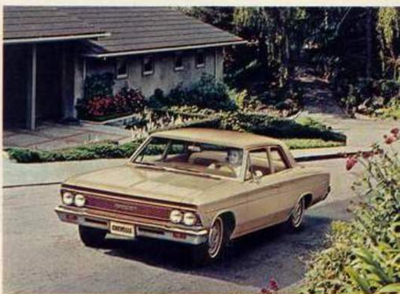
Chevelle 300 Deluxe 2-Door Sedan in Cameo Beige.