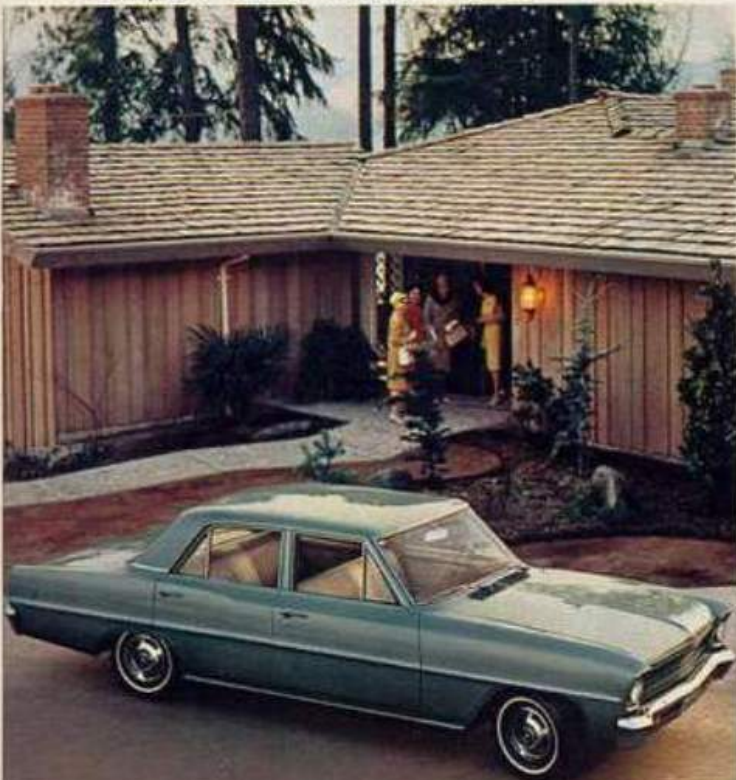
Nova 4-Door Sedan in Willow Green.

Chevy II Options and Custom Features add to pleasant motoring and are sensibly priced. Some are presented in this folder and on the back cover.