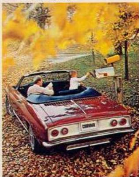
Corvaire Corsa Convertible in Aztec Bronze.