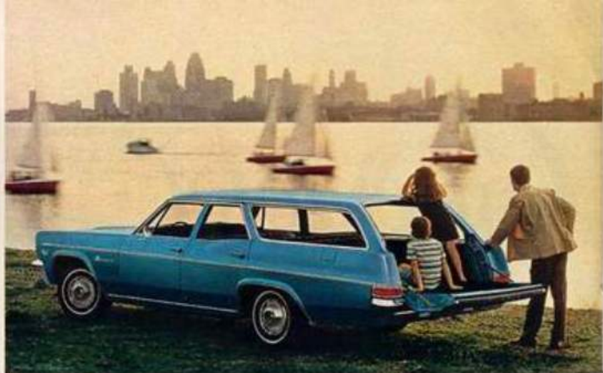
Impala 3-Seat Station Wagon in Marina Blue.