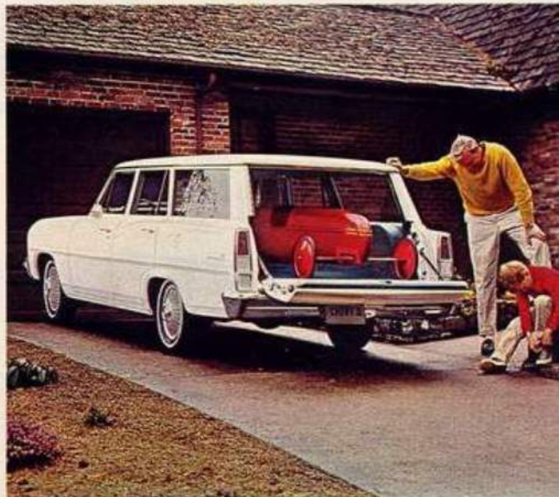
Nova 2-Seat Station Wagon in Ermine White.