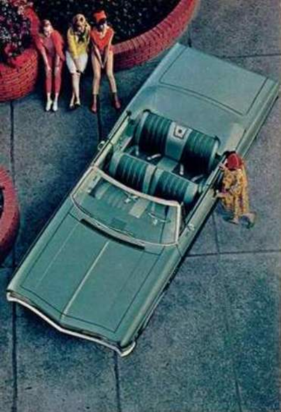
Impala Convertible in Artesian Turquoise.