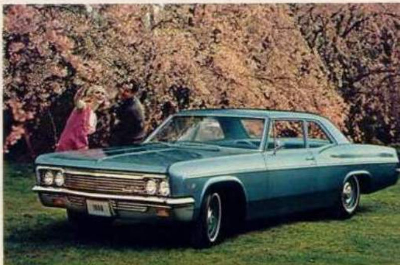
Bel Air 2-Door Sedan in Tropic Turquoise.

Moderate-cost Options and Custom Features are designed to tailor a '66 Chevrolet to your needs. Some are shown or described here and on the back cover.