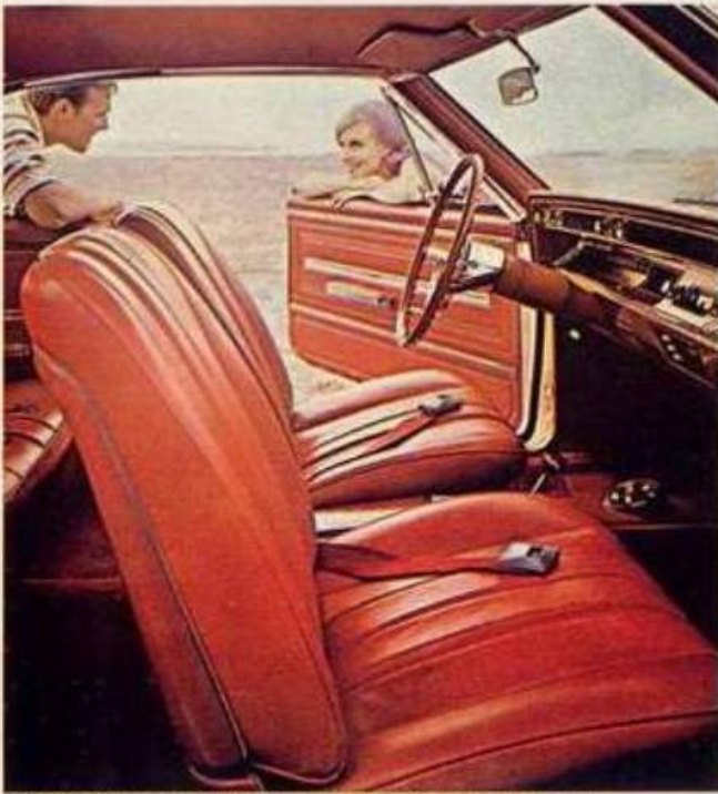
SS 396 Coupe Interior in Red with Strato-Bucket Seats.

Chevelle for '66 is marked by a pleasing mid-size, overall excellence and value. Exclusive look for the new SS 396 series. A totally new hardtop sport sedan makes its bow. Dramatic new recessed rear window on sport coupes. There's new styling at front, sides and rear. A new, more convenient-to-operate ignition switch. Seat belts now in rear as well as front. Outside rearview mirror. New fender inner skirts to cut road splash under the hood. Horsepower can be ordered up to 360 with SS models. Standard transmission is now synchronized in all forward speeds. A complete power team chart is shown on the back cover.