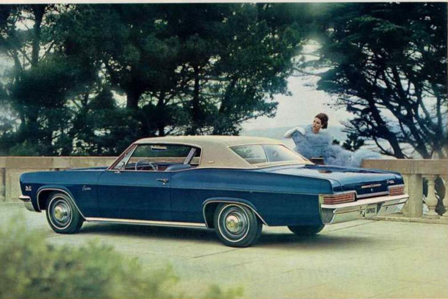
Caprice Custom Coupe in Danube Blue with Beige Vinyl Top.

Chevrolet's regal new series, as elegant as the high-priced cars but at Chevrolet prices. Four models—three entirely different profiles. A prestige limousine look for the custom coupe roof line, classic hardtop beauty in custom sedan and the look of hand-rubbed wood paneling on 2- and 3-seat custom wagons. Exclusive Caprice identification. Dual color-keyed body striping on hardtops. Special Jet-smoother ride refinements. Lavishness comes in a great variety of interiors. The wagons have distinctive all-vinyl interiors. Standard in custom coupe and