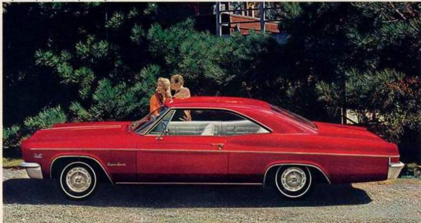
Impala Super Sport Coupe in Regal Red.

seats are standard in Super Sports. All seats are foam cushioned. Armrests with fingertip door releases built in. Electric clock with sweep second hand. Parking brake warning light. Back-up lights. Even automatic illumination when you open front doors, the glove compartment or the spacious trunk. Up to eight interior hues, 15 Magic-Mirror exterior colors. Order an Impala with Turbo Hydra-Matic transmission . . . the ultimate in automatic driving.