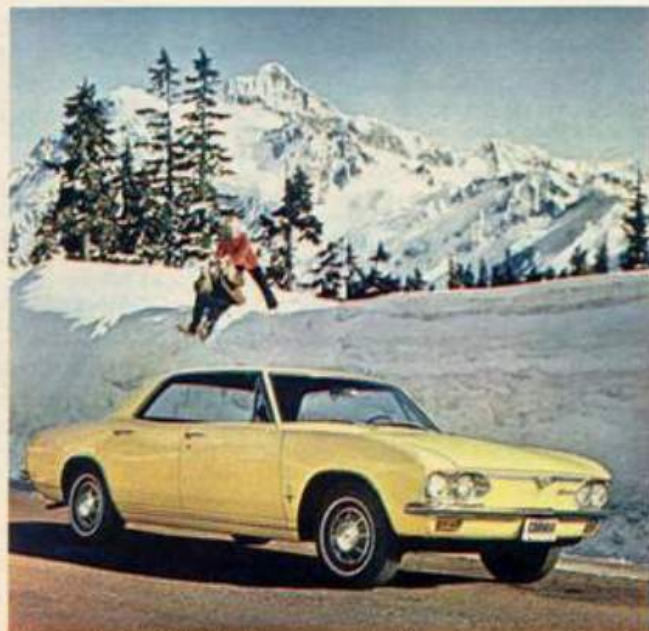
Monza Sport Sedan in Lemonwood Yellow.

Most chosen Corvair series: sport coupe, sport sedan and convertible. Monza details (found in Corsa, too): wheel opening moldings; sport-styled wheel covers. Front bucket seats. Fold-down rear seat (except convertibles). Carpeting on virtually flat floors. Automatic interior lighting. Glove compartment and back-up lights. Seven interior colors.