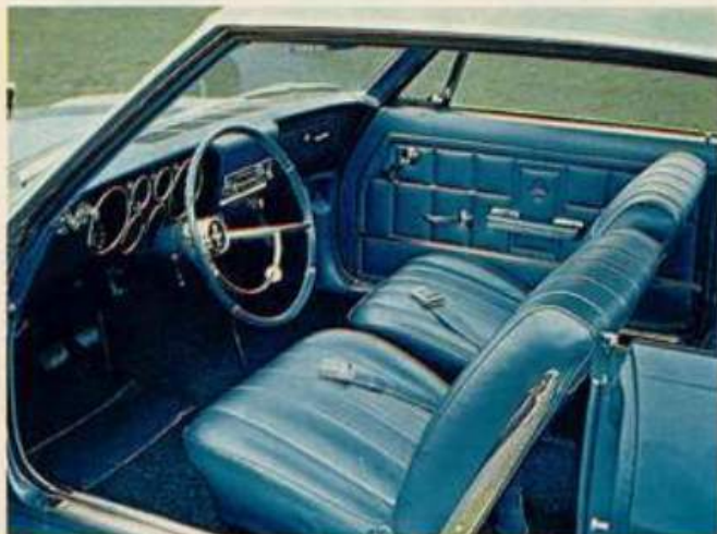
Corsa Sport Coupe Interior in Bright Blue.

Sportiest of all Corvairs, in convertible and sport coupe models. Fully instrumented, including tachometer, trip odometer and special gauges. Up to seven all-vinyl interiors. Seat belts, front and rear. Four-carburetor 140-hp air-cooled engine standard. 180-hp Turbo-Charged engine can be ordered. New standard items include outside rearview mirror.