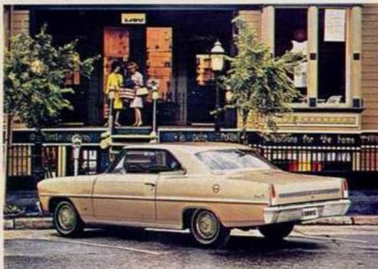
Chevy II Nova Sport Coupe in Sandalwood Tan.