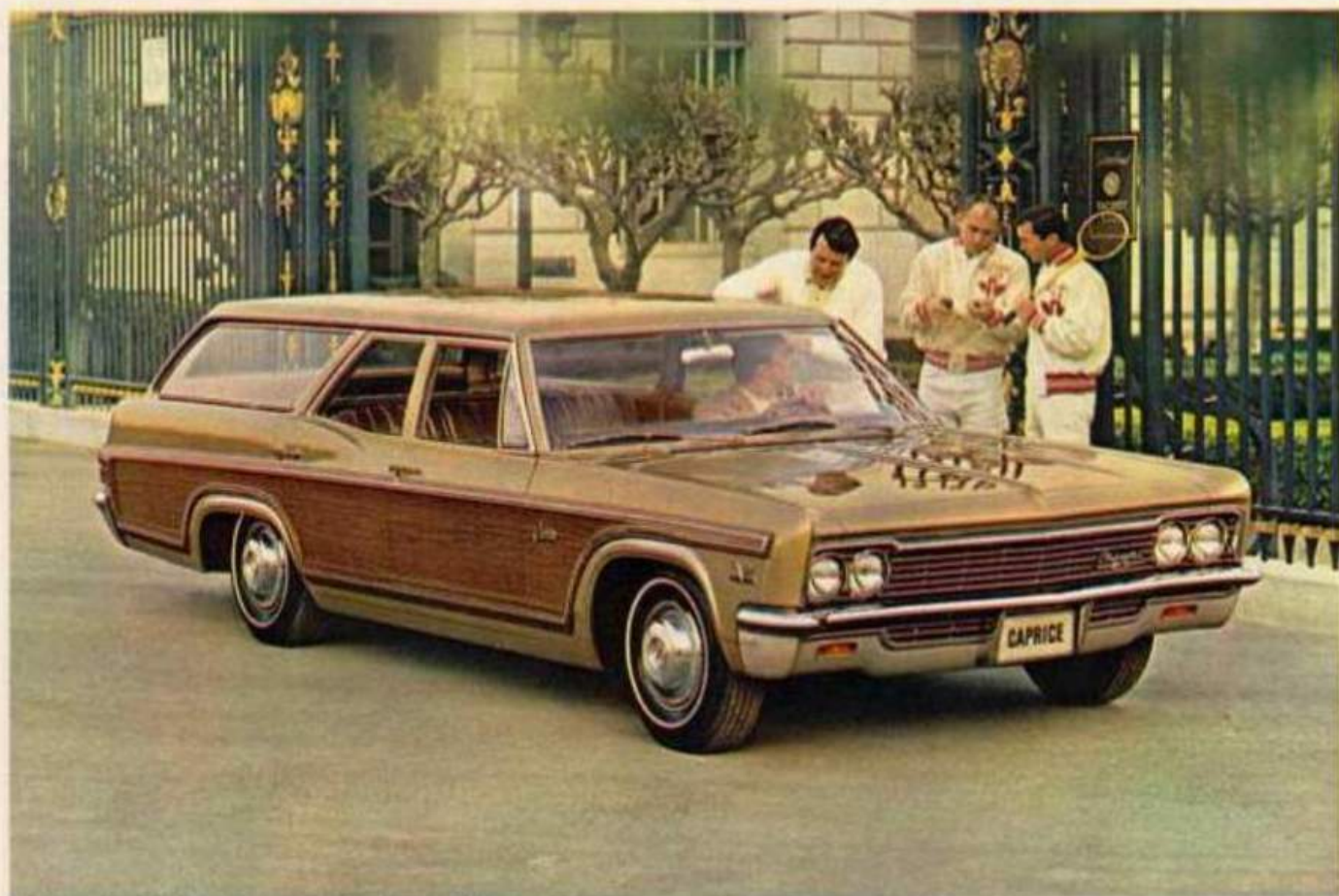
Caprice 3-Seat Custom Wagon in Sandalwood Tan.