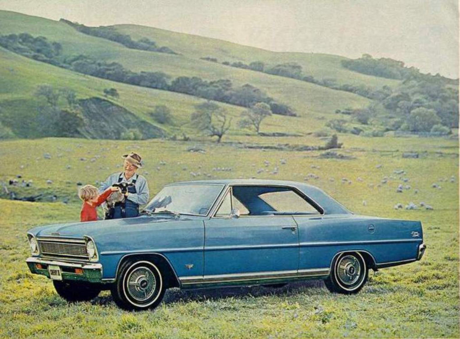
Nova Super Sport Coupe in Marina Blue.