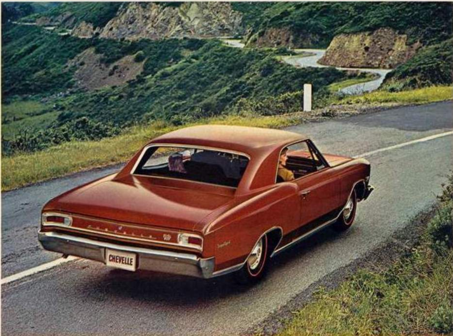
SS 396 Coupe in Aztec Bronze.

Chevelle for '66 is marked by a pleasing mid-size, overall excellence and value. Exclusive look for the new SS 396 series. A totally new hardtop sport sedan makes its bow. Dramatic new recessed rear window on sport coupes. There's new styling at front, sides and rear. A new, more convenient-to-operate ignition switch. Seat belts now in rear as well as front. Outside rearview mirror. New fender inner skirts to cut road splash under the hood. Horsepower can be ordered up to 360 with SS models. Standard transmission is now synchronized in all forward speeds. A complete power team chart is shown on the back cover.