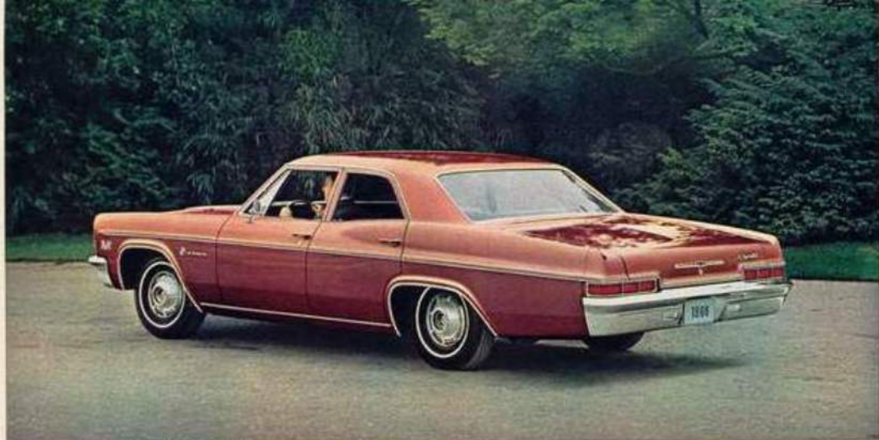
Impala 4-Door Sedan in Aztec Bronze.