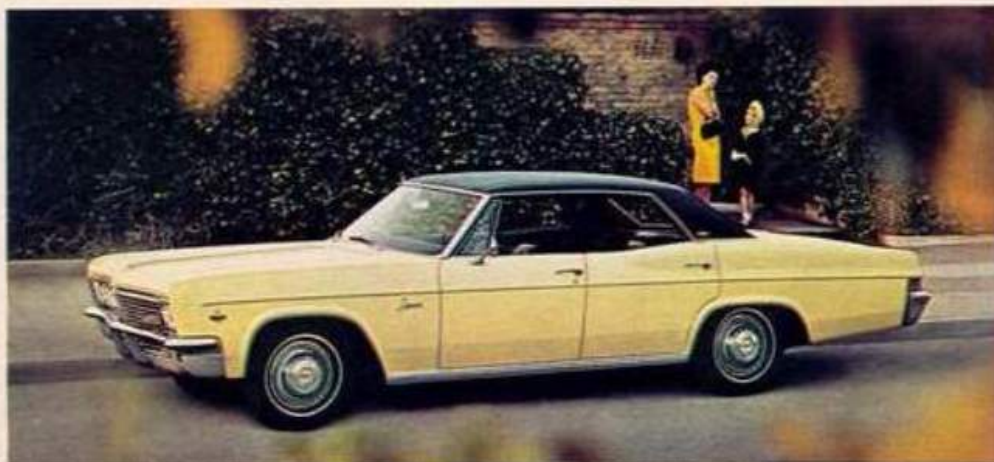
Chevrolet Caprice Custom Sedan in Lemonwood Yellow with Black Vinyl Top.