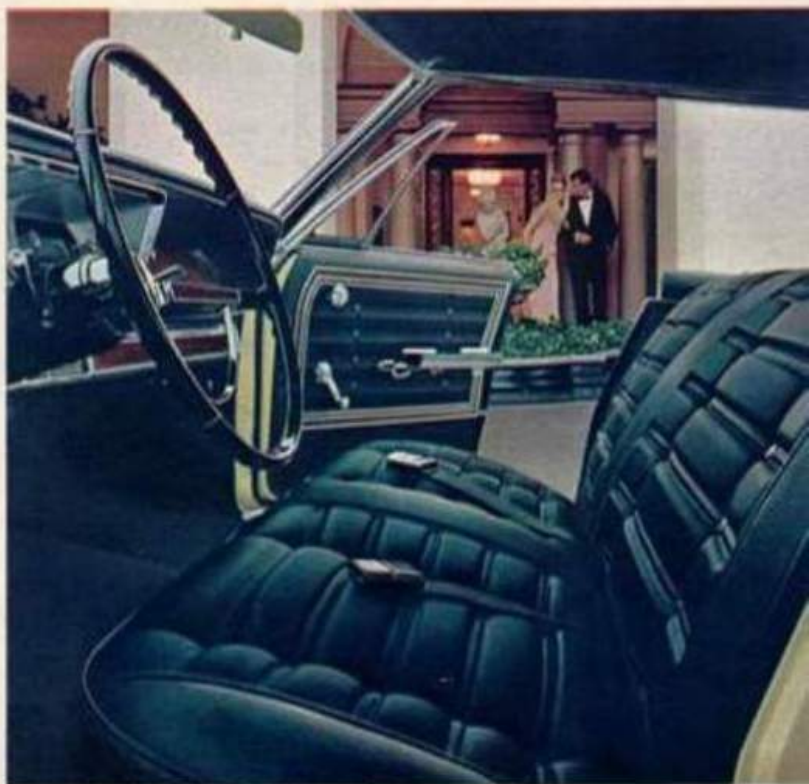
Caprice Custom Sedan Interior in Black.

Described and illustrated in this catalog are some moderate-cost Options and Custom Features for '66 Chevrolets. They're listed on the back cover.