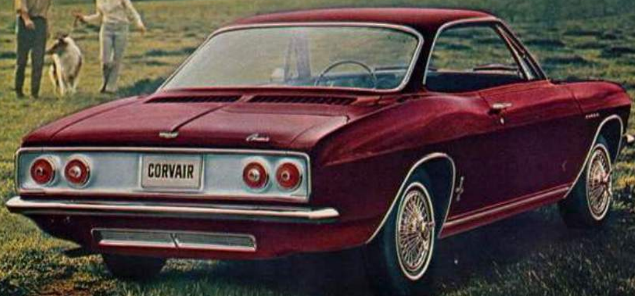
Corsa Sport Coupe in Madeira Maroon.

Corvaire '66 has it: superb handling, roadability, crisp steering, anything else that driving fun means. Fully independent suspension. Still America's only rear-engine design. Fully synchronized 3-Speed is the new standard transmission. Power team range is outstanding. Four engines from 95-hp to 180-hp turbo-supercharged version (see chart on back cover).