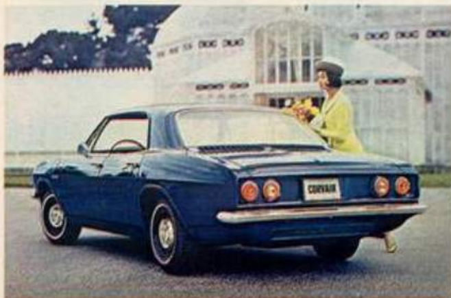
Corvair 500 Sport Sedan in Danube Blue.