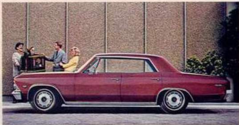
Chevelle Malibu Sport Sedan in Madeira Maroon.