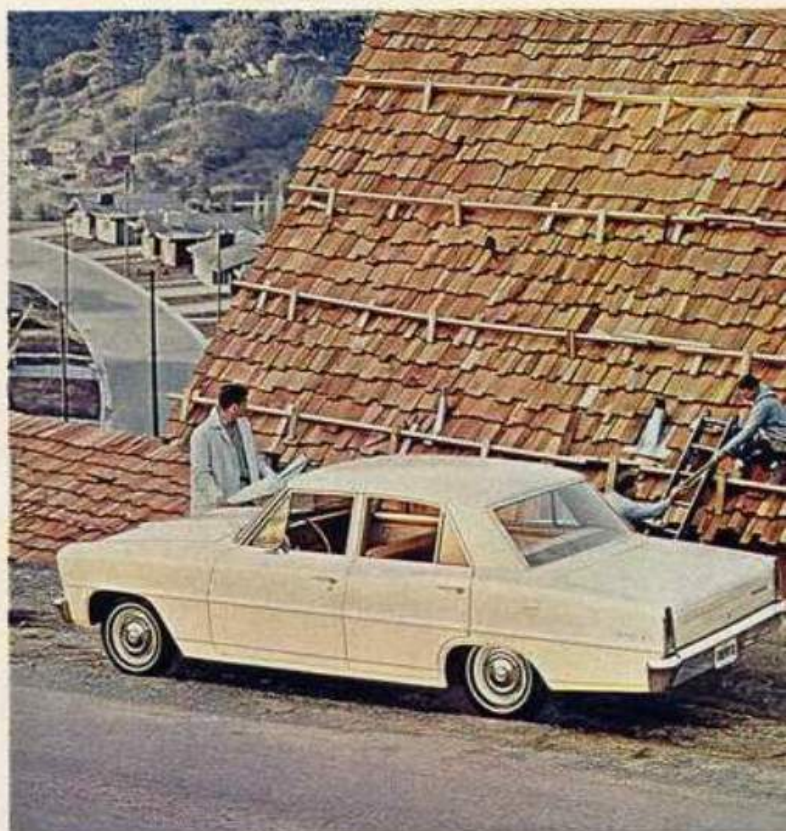
Chevy II 100 4-Door Sedan in Cameo Beige.