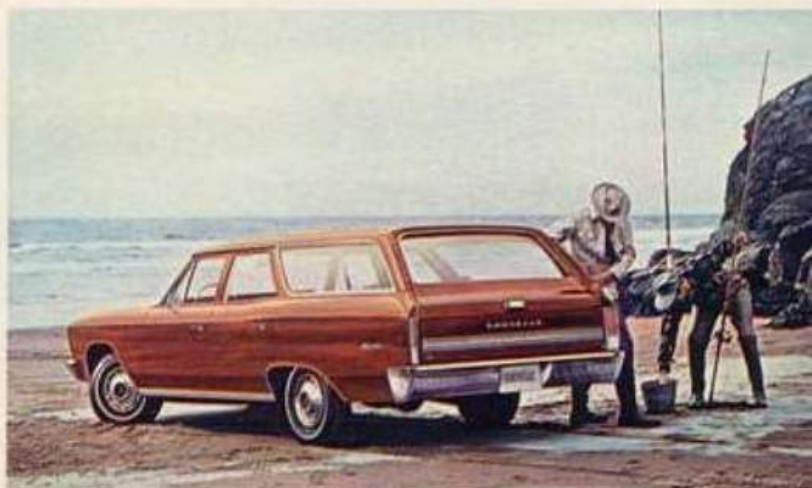
Malibu 2-Seat Station Wagon in Aztec Bronze.