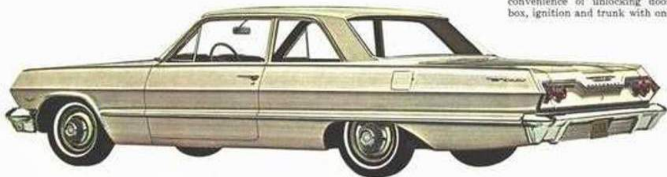
Bel Air 2-Door Sedan in Adobe Beige. Single-key locking system gives you the convenience of unlocking doors, glove box, ignition and trunk with one key.