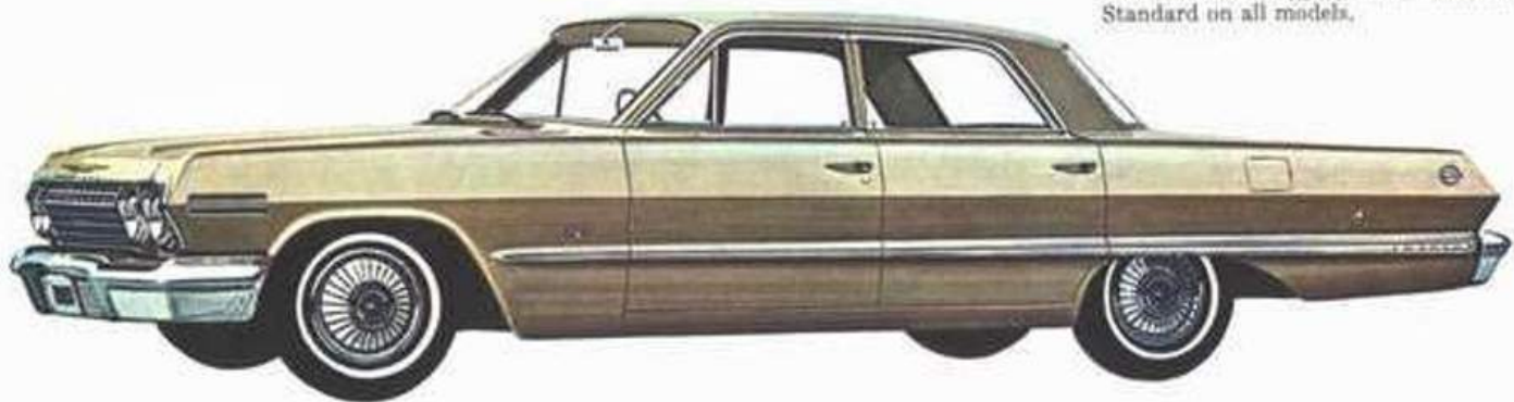
Impala 4-Door Sedan in Autumn Gold. Magic-Mirror finish gives a deep lustrous shine, resists chipping and weathering. Standard on all models.