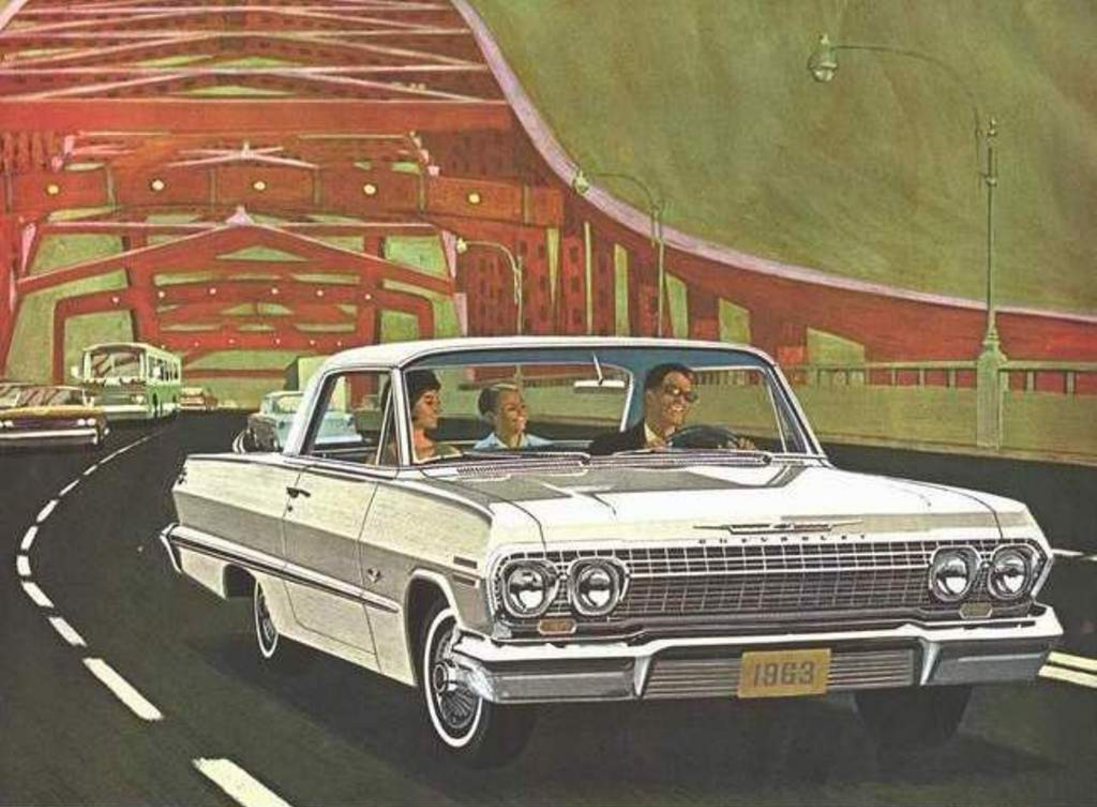
Impala Sport Coupe in Ermine White.