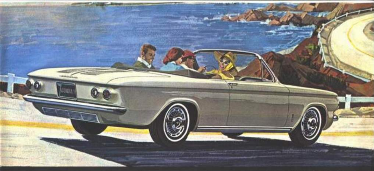
Monza Convertible in Adobe Beige.

MONZA INTERIORS —A sporty kind of luxury surrounds you inside every Monza. Leather-soft front bucket seats in rich vinyl. Interior color choice includes red, black, blue, fawn, aqua, and two new shades—white and an antique saddle. In the Coupe and Sedan, the convenience of a fold-down rear seat for extra baggage space.