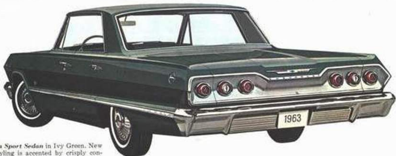
Impala Sport Sedan in Ivy Green. New roof styling is accented by crisply contoured lines in the rear; slender, straight-pillar design up front.

FIRST CHOICE FOR FULL-SIZE FASHION —Impala's styling is distinctive and elegant, emphasized by bright metal trim and exclusive Impala ornamentation. Rainbow-fresh interiors sparkle in rich harmony. Standard luxury features include an electric clock, parking brake warning light, back-up lights, extra-long armrests with finger-tip door releases. Impala for '63 comes in six elegant models: Sport Coupe and Convertible (both available in the Super Sport version*), 4-Door Sedan and Sport Sedan, and 6- and 9-Passenger Station Wagons. New option for the Impala Sport Coupe: vinyl roof covering.*