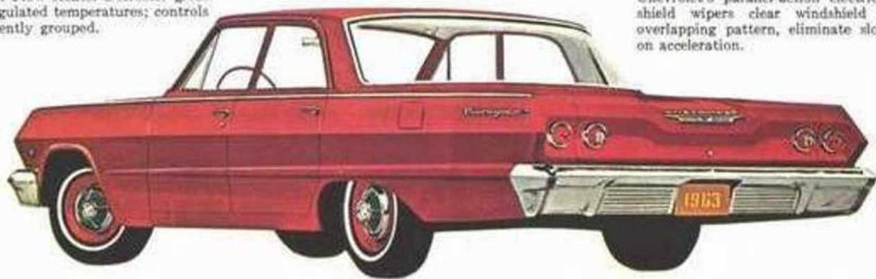
Biscayne 2-Door Sedan (not shown). Chevrolet's parallel-action electric windshield wipers clear windshield in an overlapping pattern, eliminate slowdown on acceleration.