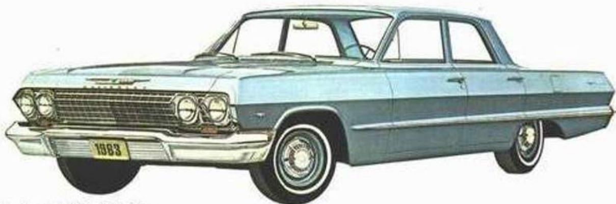
Bel Air 4-Door Sedan in Silver Blue. Big, wide door openings. Plenty of head, hip, leg and shoulder room in every model.

A WISE INVESTMENT THAT LOOKS LIKE YOU SPLURGED —If a blend of beauty and price has anything to do with popularity, this year's Bel Air is again on its way to being a big favorite. Beautiful exterior styling with touches of bright trim promises you lasting value. Inside, radiantly colorful upholstery. For extra worth, all Bel Airs feature deep-twist carpeting and vinyl headlining. Included in the modest price are foam-cushioned seats front and back, glove box light, automatic dome light and twin rear ashtrays. Choose from four models: 2- and 4-Door Sedans, 6- and 9-Passenger Wagons.