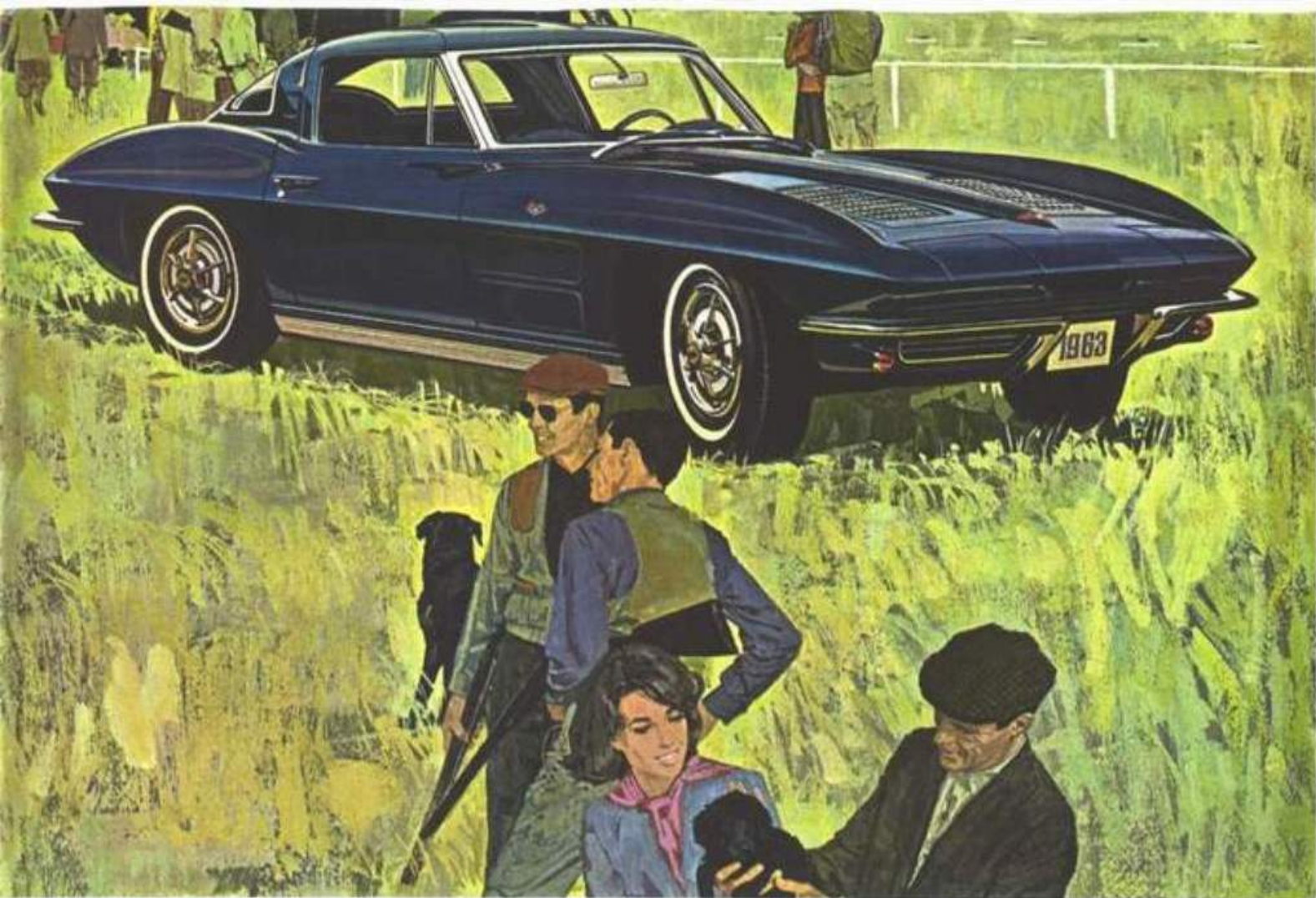
Corvette Sting Ray Sport Coupe in Daytona Blue.