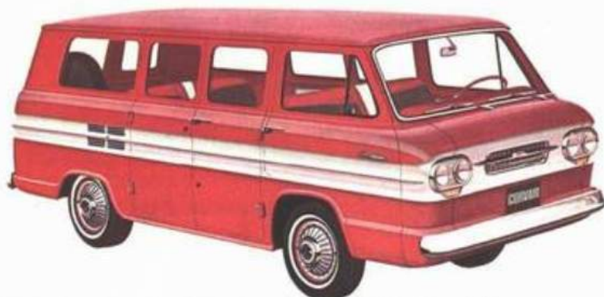
Corvaire Greenbrier De Luxe Sports Wagon in Cardinal Red and Cameo White.

ALL BUSINESS ON THE ROAD, ALL PLEASURE ON THE ROAD —Made to order for business, pleasure or camping, the new Corvaire Greenbrier Sports Wagon lets you do what you want in a big way. Through giant-size double doors, side and rear, you can load up to 175.5 cu. ft. of cargo. With the optional* third seat, nine people can be seated comfortably. For camping, Greenbrier is an ideal companion; complete equipment* is available. New easy-care features such as extended-life exhaust system and self-adjusting brakes help reduce Greenbrier maintenance. Greenbrier's power team: 80-hp air-cooled rear engine, 3-Speed Synchro-Mesh transmission and 3.89:1 rear axle. Powerglide* or 4-Speed Synchro-Mesh* are also offered.