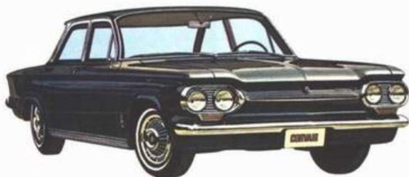
Monza 4-Door Sedan in Tuxedo Black.

MONZA INTERIORS —A sporty kind of luxury surrounds you inside every Monza. Leather-soft front bucket seats in rich vinyl. Interior color choice includes red, black, blue, fawn, aqua, and two new shades—white and an antique saddle. In the Coupe and Sedan, the convenience of a fold-down rear seat for extra baggage space.