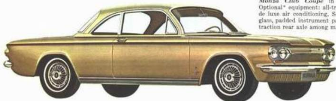
Monza Club Coupe in Saddle Tan. Optional* equipment: all-transistor radio, de luxe air conditioning, Soft-Ray tinted glass, padded instrument panel and Posi-traction rear axle among many others.

BUCKET SEAT OR BACK SEAT—MOST FUN TO GO IN —This Monza is made to be enjoyed. Elegant front bucket seats (standard on all Monzas), plush interiors and exclusive exterior trim make it more distinctive than ever. De luxe steering wheel, back-up lights, full wheel covers, glove box light and rear ashtrays are also standard. Sample any Monza—4-Door Sedan, Coupe or Convertible—and you'll see why it's the most sought after car of its kind. For those who like a special brand of driving, there's the new Spyder option* for the Coupe and Convertible.