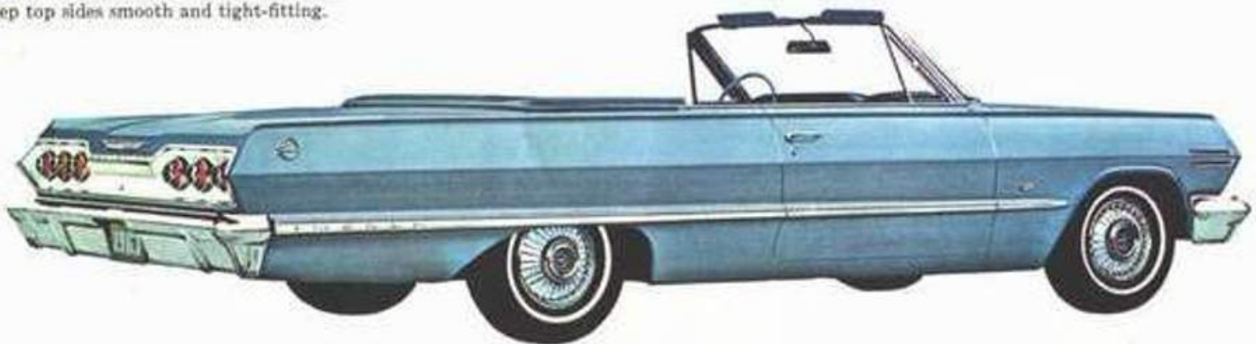
Impala Convertible in Azure Aqua. Weatherproofed Chevron top features welded seams; new stainless steel cables keep top sides smooth and tight-fitting.