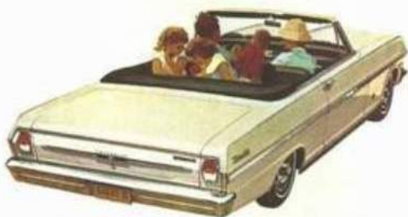
Chevy II Nova 400 Super Sport Convertible in Ermine White.