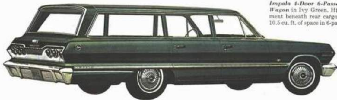
Impala 4-Door 6-Passenger Station Wagon in Ivy Green. Hidden compartment beneath rear cargo floor provides 10.5 cu. ft. of space in 6-passenger models.

EASIEST-TO-LIVE-WITH WAGONS OF THEM ALL —Chevrolet for '63 brings you new verve and station wagon versatility in a wonderful variety of roadworthy wagons. Yours in either 6- or 9-passenger models in the Impala and Bel Air series, or 6-passenger in the low-priced Biscayne. All with the convenience of four wide doors and comfortable, roomy interiors. Rear-facing third seat is standard on 9-passenger models. Putting them to work is remarkably simple. For example, 6-passenger wagons convert to flat loading with one motion. Stowage space: up to 97.5 cu. ft. between front seat and tailgate.