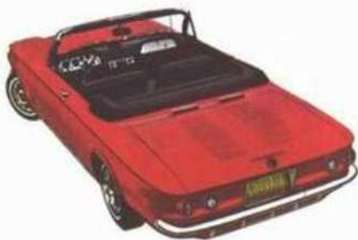
Corvair Monza Spyder Convertible in Ember Red.

Whatever you look for in a car this year, you can trust that your Chevrolet dealer has it just the way you like it. Style: four fresh kinds with 33 models to choose from. Variety: luxurious full-size Chevrolets, fashionable Chevy II models, fun-loving Corvairs and the new Corvettes. There's a big choice in engines, too: Chevrolet's new 6 and popular V8's, Chevy II's thrifty 4 or 6 and Corvair's air-cooled 6's. Also, a selection of Corvette V8's. For value, Chevrolet tops its own high standards. Gives you the kind of beauty and quality that's built for keeps. Price? Couldn't be better! Visit your Chevrolet dealer's One-Stop Shopping Center. See the things that make Chevrolets America's best liked, most wanted cars. Then GO Chevrolet for '63—it's exciting!