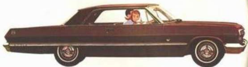
Chevrolet Impala Super Sport Coupe in Cordovan Brown.