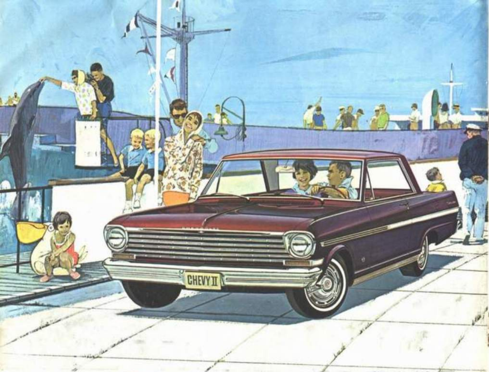
Chevy II Nova 400 Super Sport Coupe in Palomar Red.