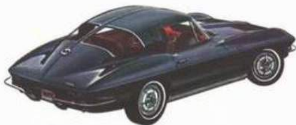
Corvette Sting Ray Sport Coupe in Tuxedo Black.