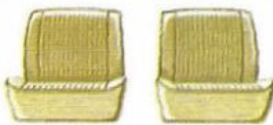
Bucket seats available at extra cost for Custom models

Custom El Camino interior —last word in fine-car luxury with rich nylon cloth and vinyl seats, deep-pile carpeting, and special vinyl sidewall trim and headlining. Standard extras include bright metal seat end moldings, dual armrests and sunshades, de luxe steering wheel, cigar lighter, electric clock, glove box light and door pillar dome light switches. Individual bucket seats in leather-grain vinyl trim are available as an extra-cost option.