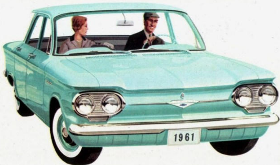
CORVAIR 500 4-DOOR SEDAN in Seamist Turquoise. Family sedan room and comfort; dual headlights and electric windshield wipers are standard equipment.

Shown on front cover: CORVAIR 700 4-DOOR SEDAN in Roman Red, LAKEWOOD 700 4-DOOR STATION WAGON in Jewel Blue.