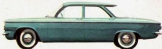
CORVAIR 700 4-DOOR SEDAN in Arbor Green... with canopy roof line, Monostrut Body by Fisher and Safety Plate Glass.

INTERIORS—Chevy's Corvair is loaded with family features. Shown is the 700 4-Door Sedan. Note handy coat hooks in back. 700 comes in three color-keyed interior choices; 500 also has three interiors color-keyed to exteriors.