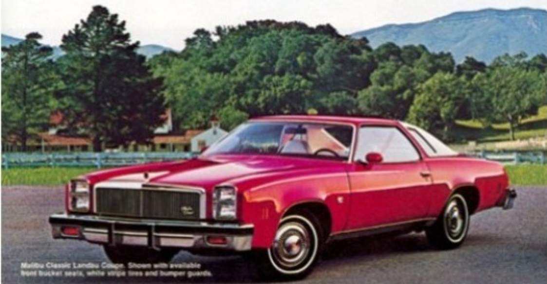
Malibu Classic Landau Coupe. Shown with available front bucket seats, white stripe tires and bumper guards.