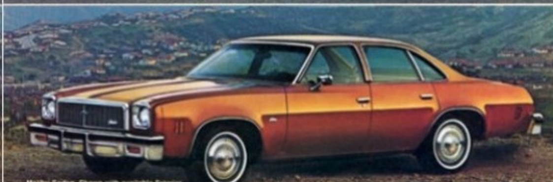
Malibu Sedan. Shown with available Exterior Decor Package, full wheel covers, white stripe tires, remote-control outside mirror, 6669 glass, bumper guards and rub strips.