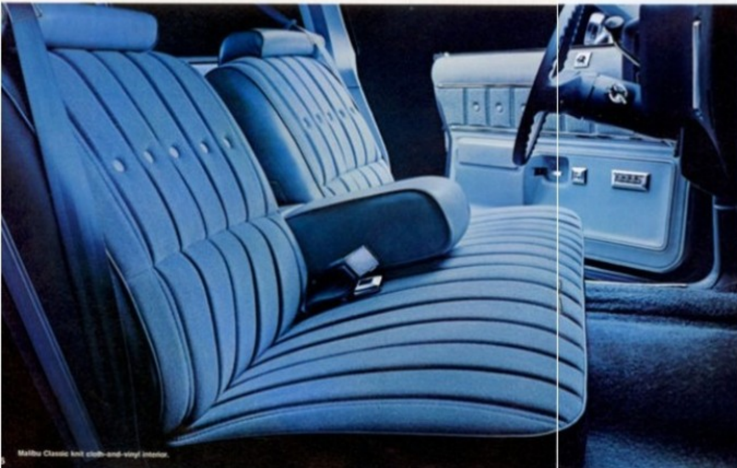
Malibu Classic knit cloth-and-vinyl interior.

The value and quality that have always distinguished the Chevelle Malibu are obvious once again this year in its handsome interior. It features rich nylon cut-pile carpeting stretching from wall to wall and a new sport cloth-and-vinyl upholstery in black, blue or buckskin, plus white for coupe only (with accents in black, blue, green or firethorn).