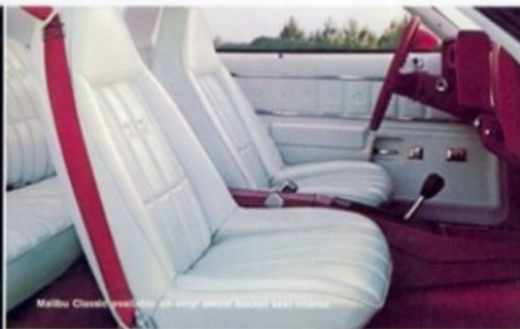
Malibu Classic available in all-vinyl or sport cloth-and-vinyl interior.