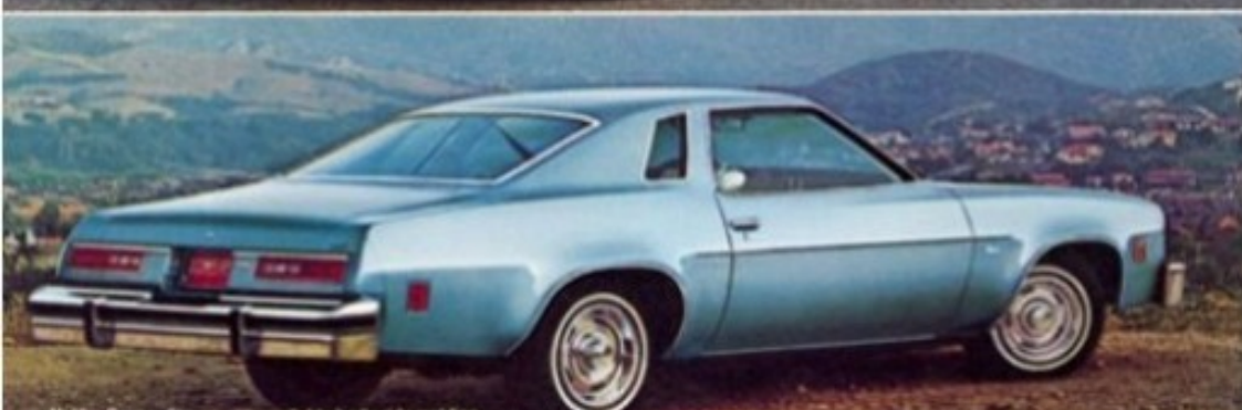
Malibu Coupe. Shown with available body side molding, Exterior Decor Package, Rally wheels, white stripe tires, bumper guards and rub strips.