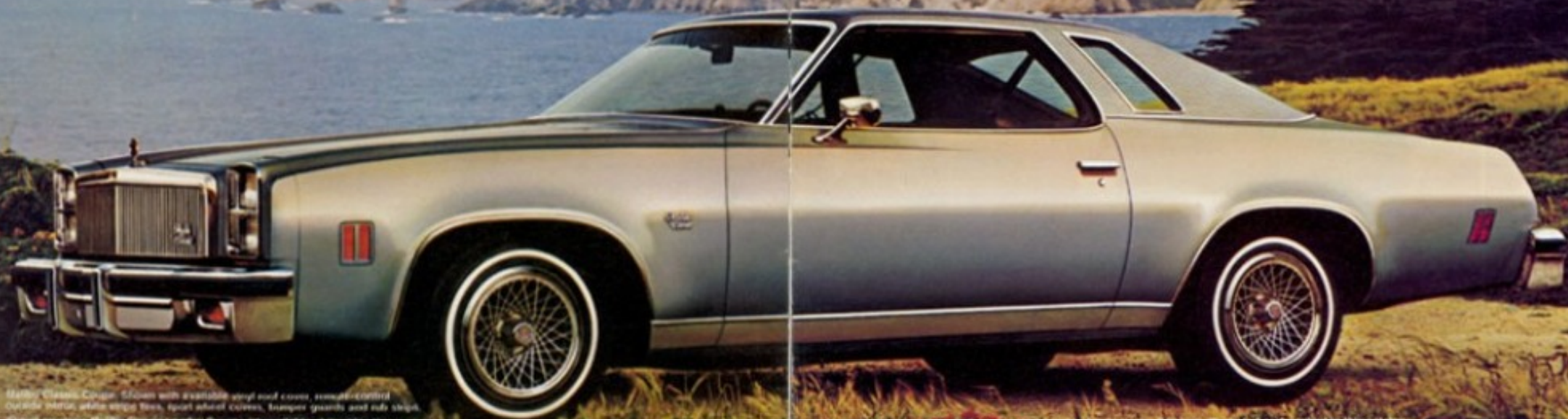
Malibu Chevelle Coupe. Shown with available vinyl roof cover, remote-control outside mirror, white stripe tires, sport wheel covers, bumper guards and rub strip. Shown over door. Malibu Chevelle Limited Coupe with available white stripe tires, full wheel covers, bumper rub strip. *See dealer for complete details.

You can verify that for yourself on the following pages.