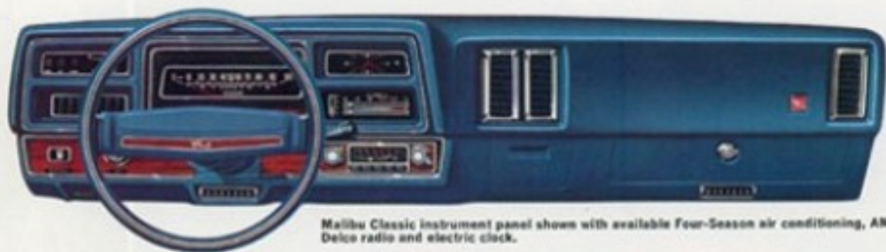
Malibu Classic instrument panel shown with available Four-Season air conditioning, AM/FM Delco radio and electric clock.