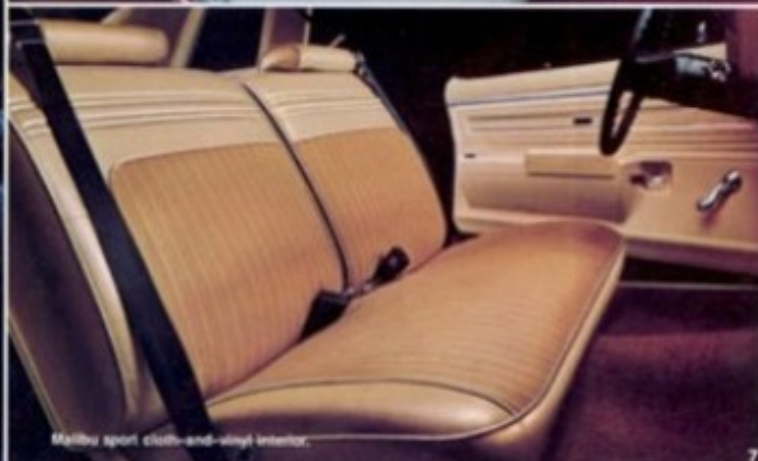
Malibu sport cloth-and-vinyl interior.