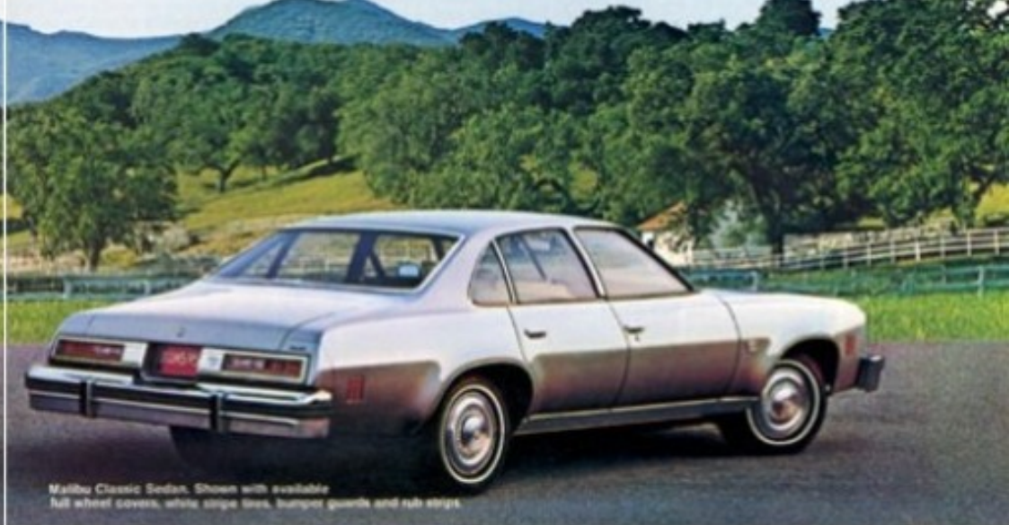
Malibu Classic Sedan. Shown with available full wheel covers, white stripe tires, bumper guards and rub strips.