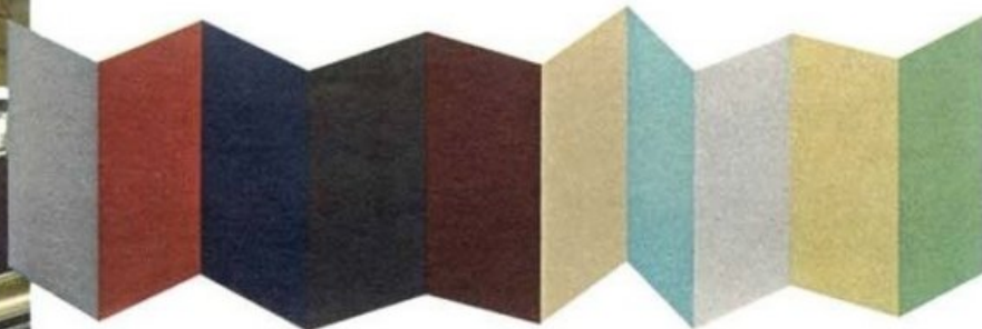
Above are colors available not shown on cars illustrated on previous pages