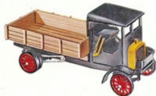
33 - Camion Berliet 22 CV 1913