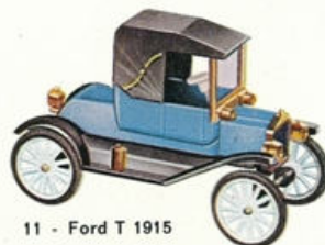
11 - Ford T 1915