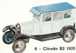
6 - Citroën B2 1925