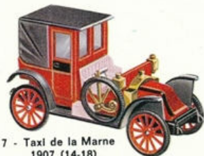
7 - Taxi de la Marne 1907 (14-18)