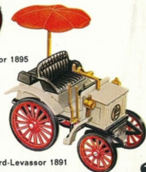
18 - Panhard-Levassor 1891