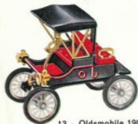
13 - Oldsmobile 1902