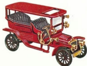
30 - PL Tonneau Roi des Belges