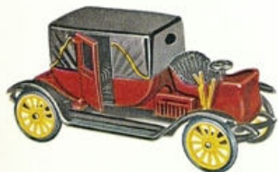
27 - Landau Park Royal 1912