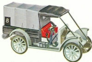
23 - Camion de Guerre 14-18