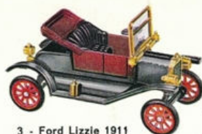
3 - Ford Lizzie 1911