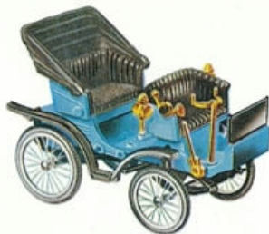
22 - Quadricycle Peugeot 1892