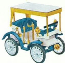
20 - Vis-à-vis Balda 1895