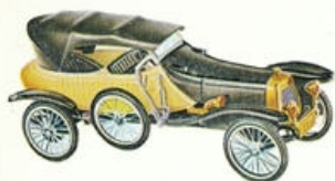
19 - Skiff Labourdette 1914