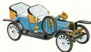
8 - Double Phaëton Peugeot 1906