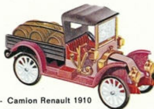
10 - Camion Renault 1910