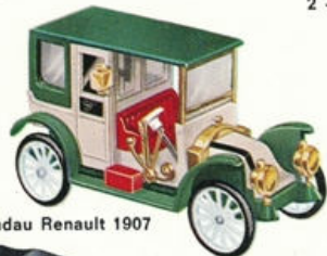
5 - Landau Renault 1907