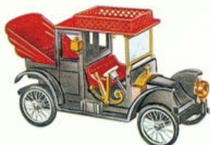
21 - Grande Remise 1906