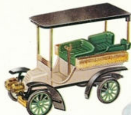
15 - Autocar 1903