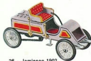
26 - Jamieson 1902