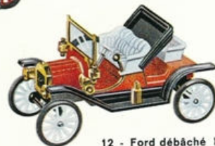
12 - Ford débâché 1907