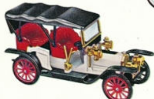
9 - Torpédo Peugeot 1906