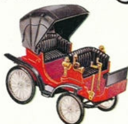
14 - Victoria Peugeot 1892