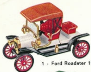
1 - Ford Roadster 1909