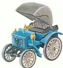
24 - Coupé PL 1892