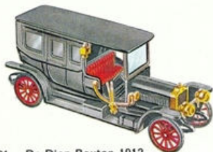
31 - De Dion-Bouton 1912