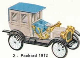
2 - Packard 1912