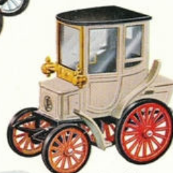
17 - Panhard-Levassor 1895