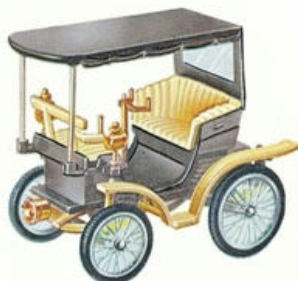
25 - Vis-à-vis à Dais 1891