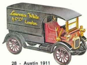
28 - Austin 1911