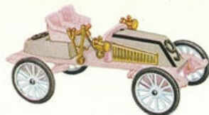
4 - Paris-Madrid 1903