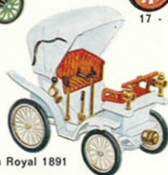
16 - Vis-à-vis Royal 1891