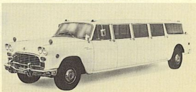
CHECKER MOTORS CORP. 2016 North Pitcher St. Kalamazoo, Mich. 49007

The Safari station wagon has similar heavy duty ride components. Power plant start with the 400 CID, V-8, 2-bbl. carb, options are the same as the Catalina above. Wheel base of the Safari is 127", while overall length is 228.8". Transmission steering and brakes are also similar to the Catalina. The "glide-away disappearing tail gate" is manually operated, but the window is electric.