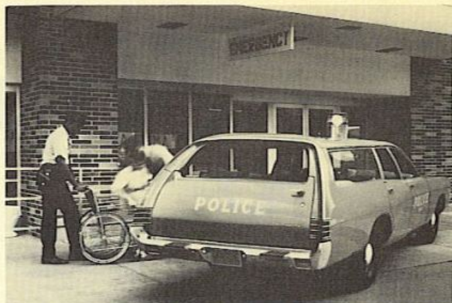
PONTIAC MOTOR DIV. General Motors Corp. Pontiac, Mich. 48503

The Fury Emergency Wagon is Plymouth's all-purpose vehicle. It can be used as a personnel or special equipment carrier or as a 1-litter ambulance. The tail gate can drop down or open as a door. With gate closed and rear seat down the floor is 99" long, and 63" with rear seat up. Tail gate opening for rear access is 29" high and 54½" wide at the floor.