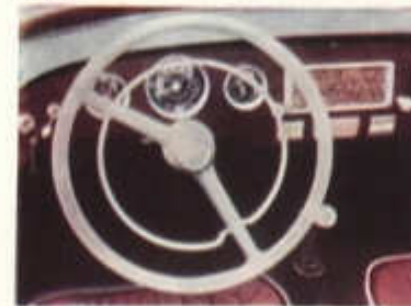
Safety steering wheel. Simple maintenance. Comfortable interior. Neatly arranged fascia panel.