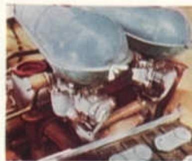
High-performance engine of 53 HP at 5100 RPM