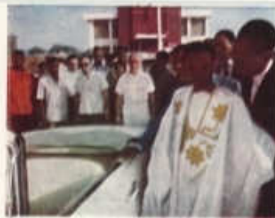
SKODA - the focus of attention at international exhibitions and trade fairs