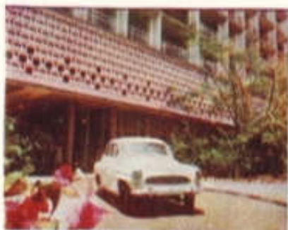
SKODA - the best recommendation for its owner