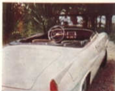
A car of crisp lines and thoroughbred styling