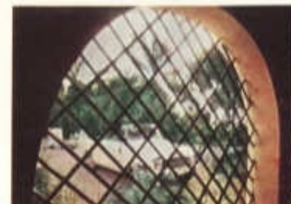
SKODA - a fast, economical, elegant car