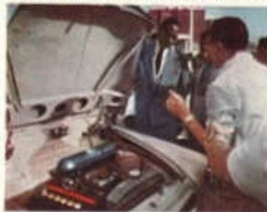
Perfect after-sales service in every part of the world