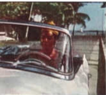
The SKODA cars have travelled throughout Africa, gaining popularity everywhere